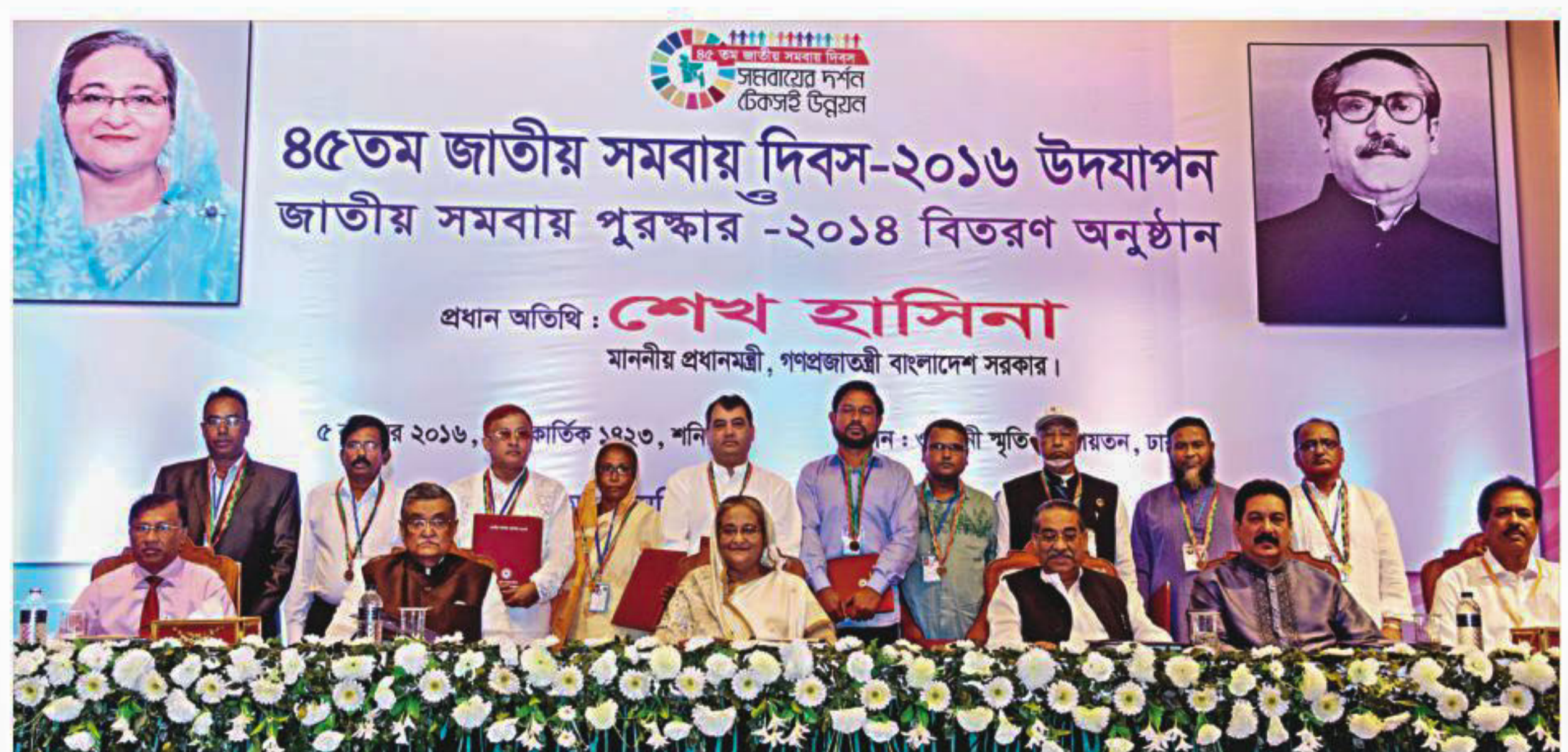
Prime Minister Sheikh Hasina poses with the recipients of National Cooperative Award 2014 at Osmani Memorial Auditorium in the capital yesterday.

BSS, Dhaka Prime Minister Sheikh Hasina yesterday called for strengthening the cooperative movement in the country, saying cooperatives can play a big role in the socio-economic development of the nation. "I firmly believe that the cooperative movement can be successful in Bangladesh and it would play a substantial role in making the country a prosperous and peaceful one in South Asia as dream by Bangabandhu," she said. "So I hope everybody relating to cooperatives would work sincerely to strengthen the movement across the country." The prime minister spoke at a function to celebrate the 45th National Cooperative Day and distribute the National Cooperative Award 2014 at Osmani Memorial Auditorium in the capital. "Father of the Nation aspired for multipurpose village cooperatives. But his brutal killing dashed the dream. We are trying to implement his vision in different ways by taking many programmes," she said. READ MORE ON B3