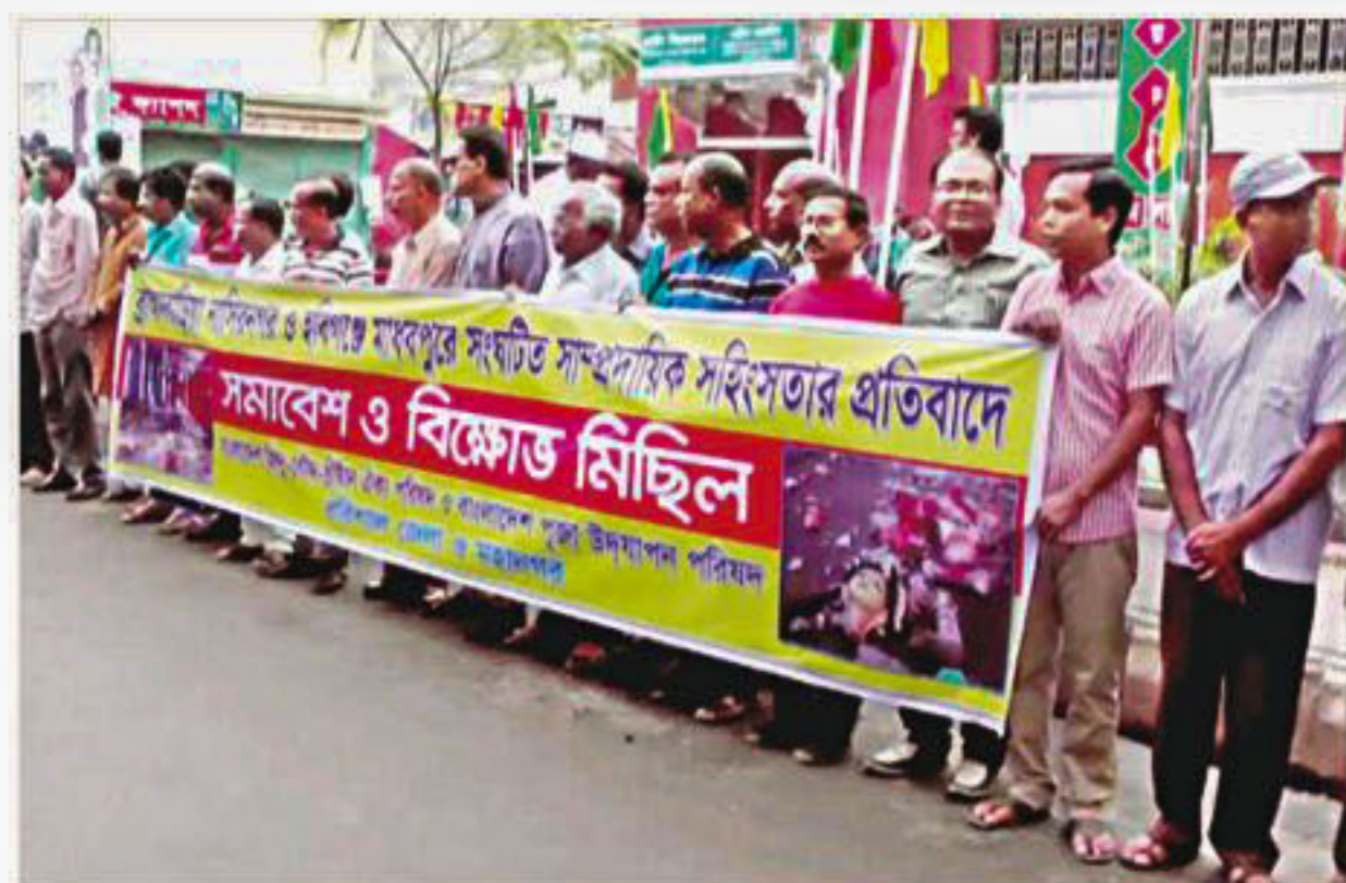
Protests spark across the country yesterday against the recent attacks on houses and places of worship of the Hindus. Clockwise from top left, Sammilito Sangskritik Jote at the capital's Shaheed Minar; torch procession at Shahbagh; human chain in front of Jatiya Press Club; human chain in Chapainawabganj; procession in Sylhet city; human chain in Barisal city; blockade at Shahbagh intersection in the capital.