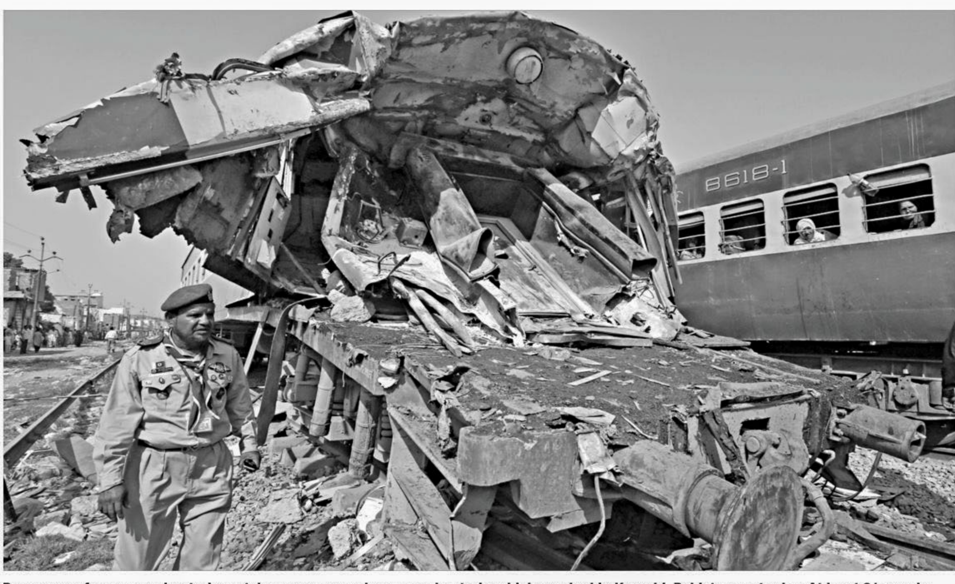
Passengers from a passing train watch as rescue workers search a train which crashed in Karachi, Pakistan yesterday. At least 21 people have been killed and dozens more injured after two trains carrying hundreds of passengers collided during morning rush hour.

Israeli troops yesterday shot dead a Palestinian who attempted to stab a soldier near the West Bank settlement of Ofra, the army said. "Palestinian assailant armed with a knife attempted to stab an Israel Defence Forces soldier guarding a bus stop near the community of Ofra," a statement in English said.