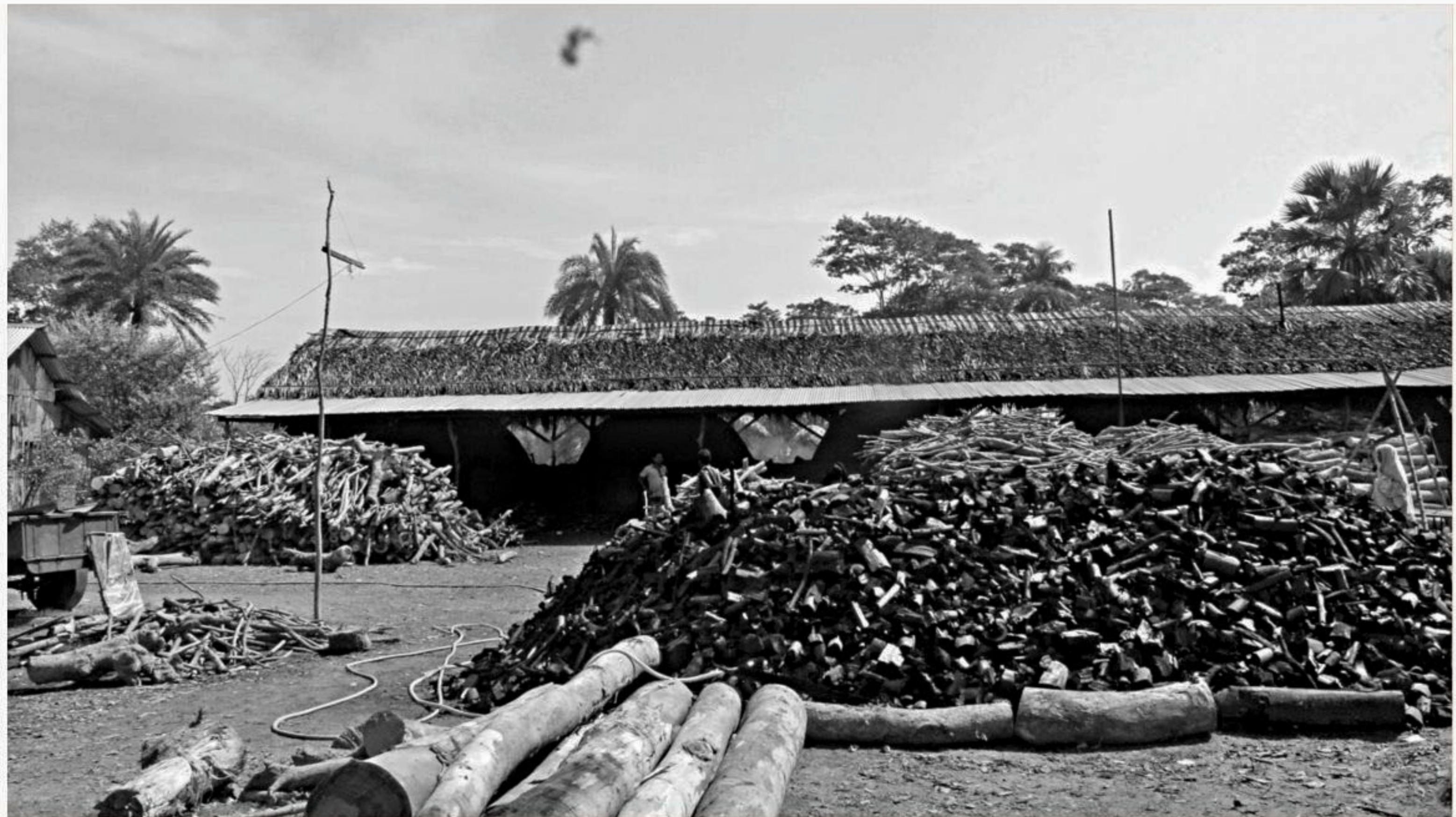
An illegal charcoal plant built by a Jubo League leader on waqf land in Kalaiya village of Baufal upazila under Patuakhali.

They are trying their best to rescue the girl and arrest the accused, said the SI, also investigation officer of the case.