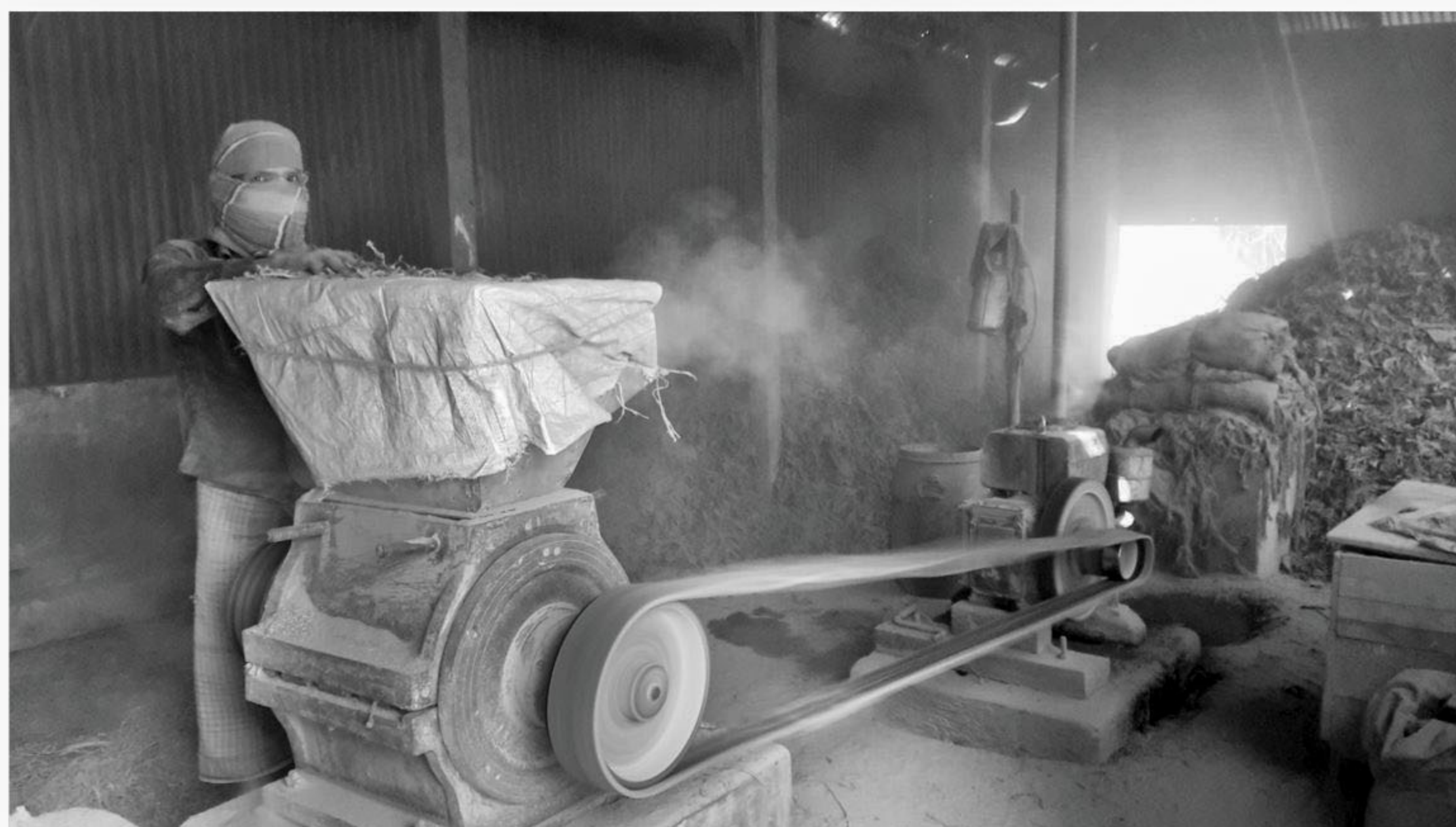
A tobacco dust factory, operating within a short distance from a clinic, a primary school and a bazar, poses serious health hazard for the locals at Gandhomaruya village in Durgapur union under Aditmari upazila of Lalmonirhat.