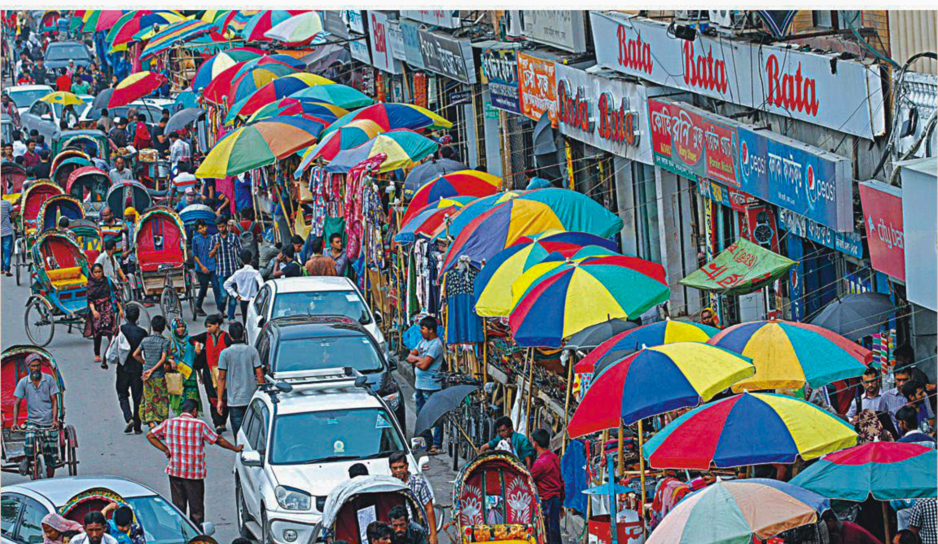
Hawkers have taken over the footpath in the New Market area and park-as-you-like vehicles on Mirpur Road near the market create traffic jams. Together they make life unbearable for pedestrians and anybody trying to move about the city. The photo was taken recently.

PRAYER TIMING NOVEMBER 2 Fazr Zohr Asr Maghrib Esha AZAN 4-50 12-45 4-00 5-32 7-15 JAMAAT 5-25 1-15 4-15 5-35 7-45 SOURCE: ISLAMIC FOUNDATION