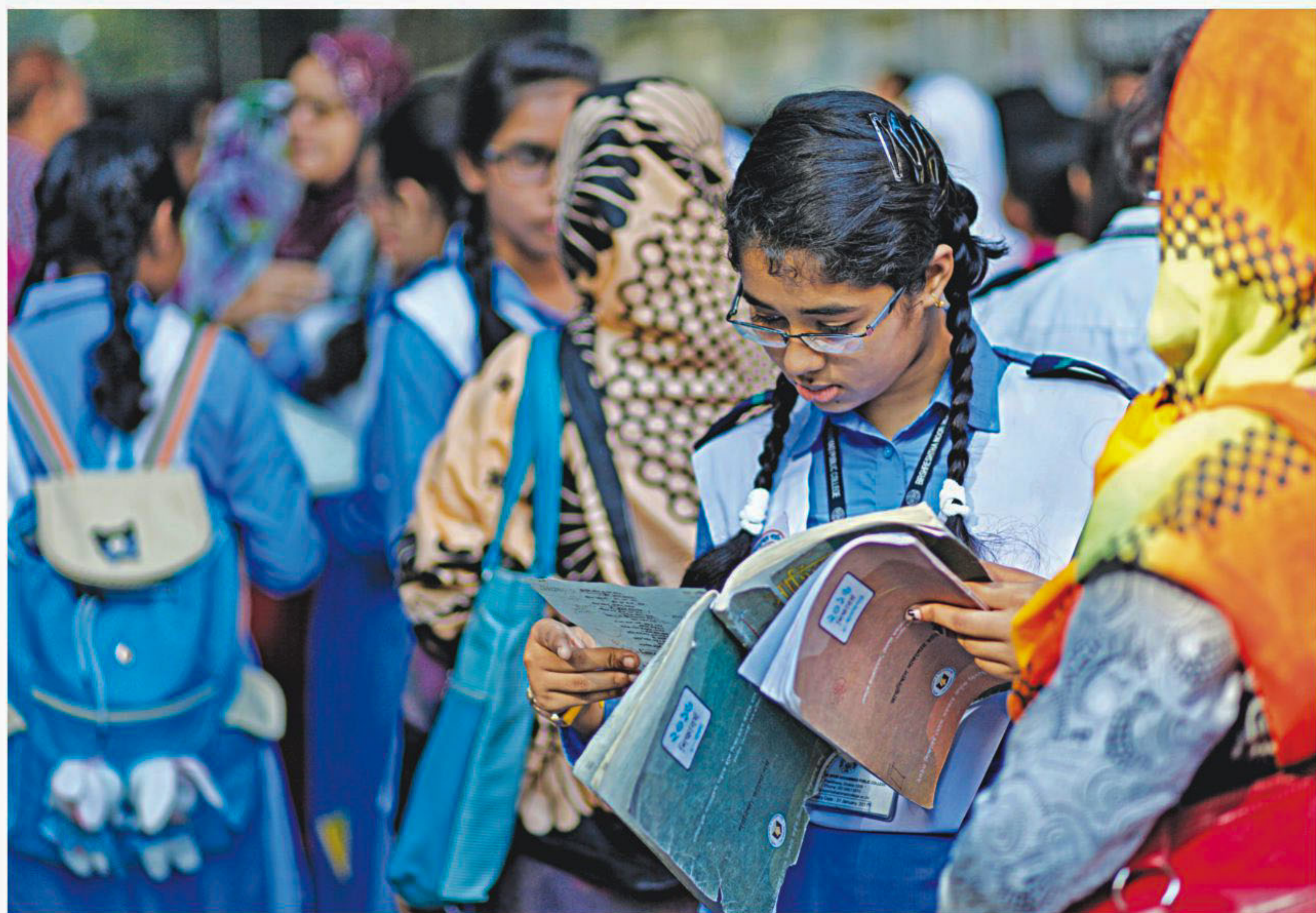
Last minute cramming of an anxious student outside before she heads into the exam hall at Government Laboratory High School in the capital yesterday. Around 24 lakh students are taking the JSC and JDC exams this year.