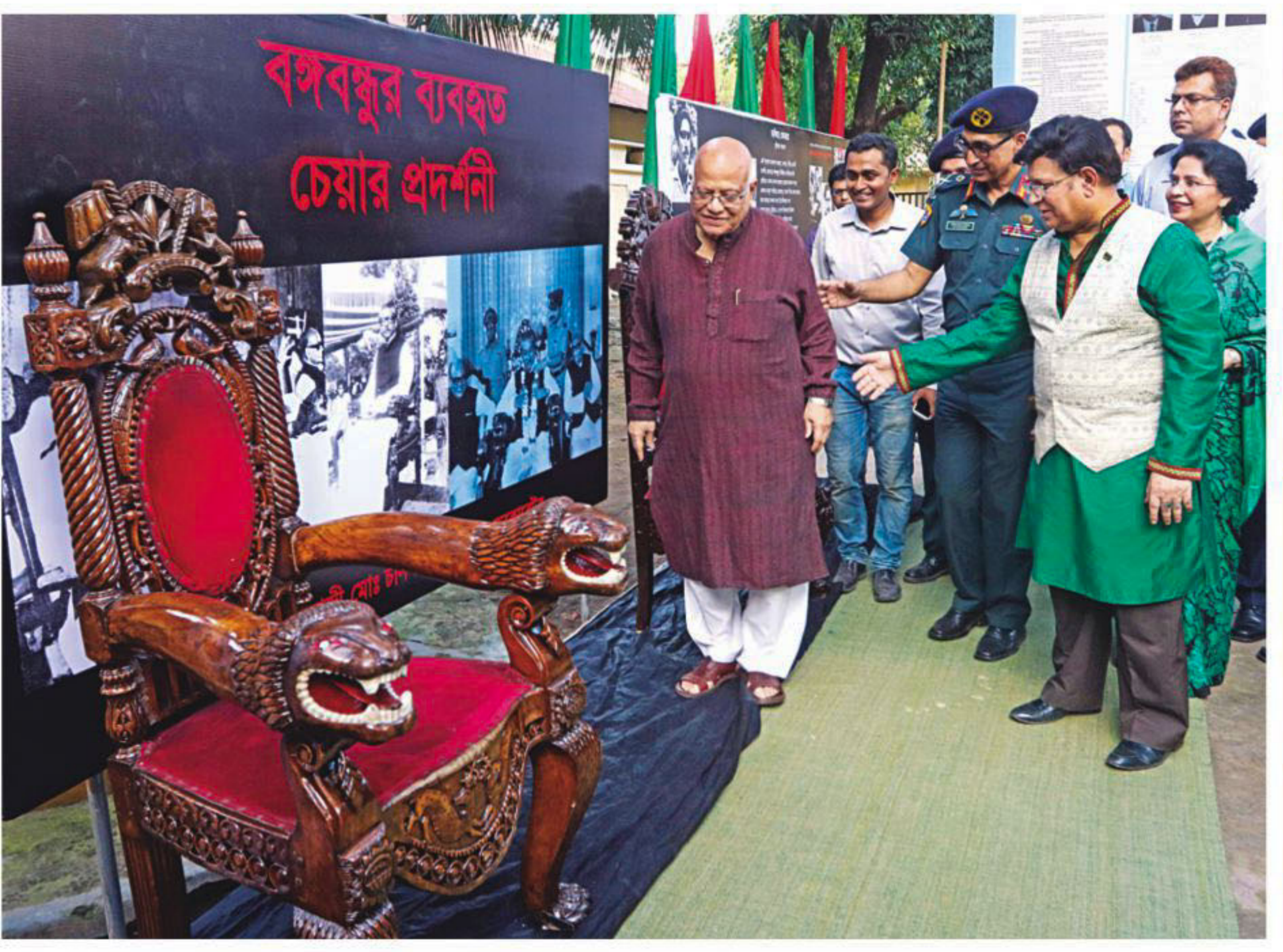
Clockwise from left, Finance Minister AMA Muhith looks at the chair used by Bangabandhu Sheikh Mujibur Rahman after inaugurating the Bangabandhu memorial museum at old Dhaka central jail on Najim Uddin Road yesterday. As part of an exhibition, visitors look at rare photographs of Bangabandhu and the four national leaders. Replicas of Bangabandhu's spectacles and smoking pipe placed near the main entrance. The museum will remain open to the public from today to Saturday.