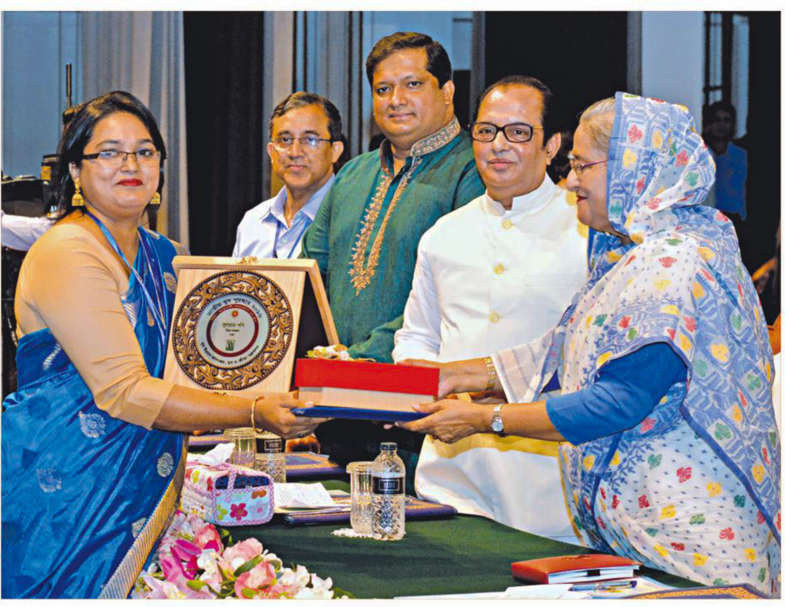
Prime Minister Sheikh Hasina hands over National Youth Award to a woman in the capital's Osmani Memorial Auditorium yesterday, marking National Youth Day. Nineteen youths got the award for their contributions to establishing self-employment projects.