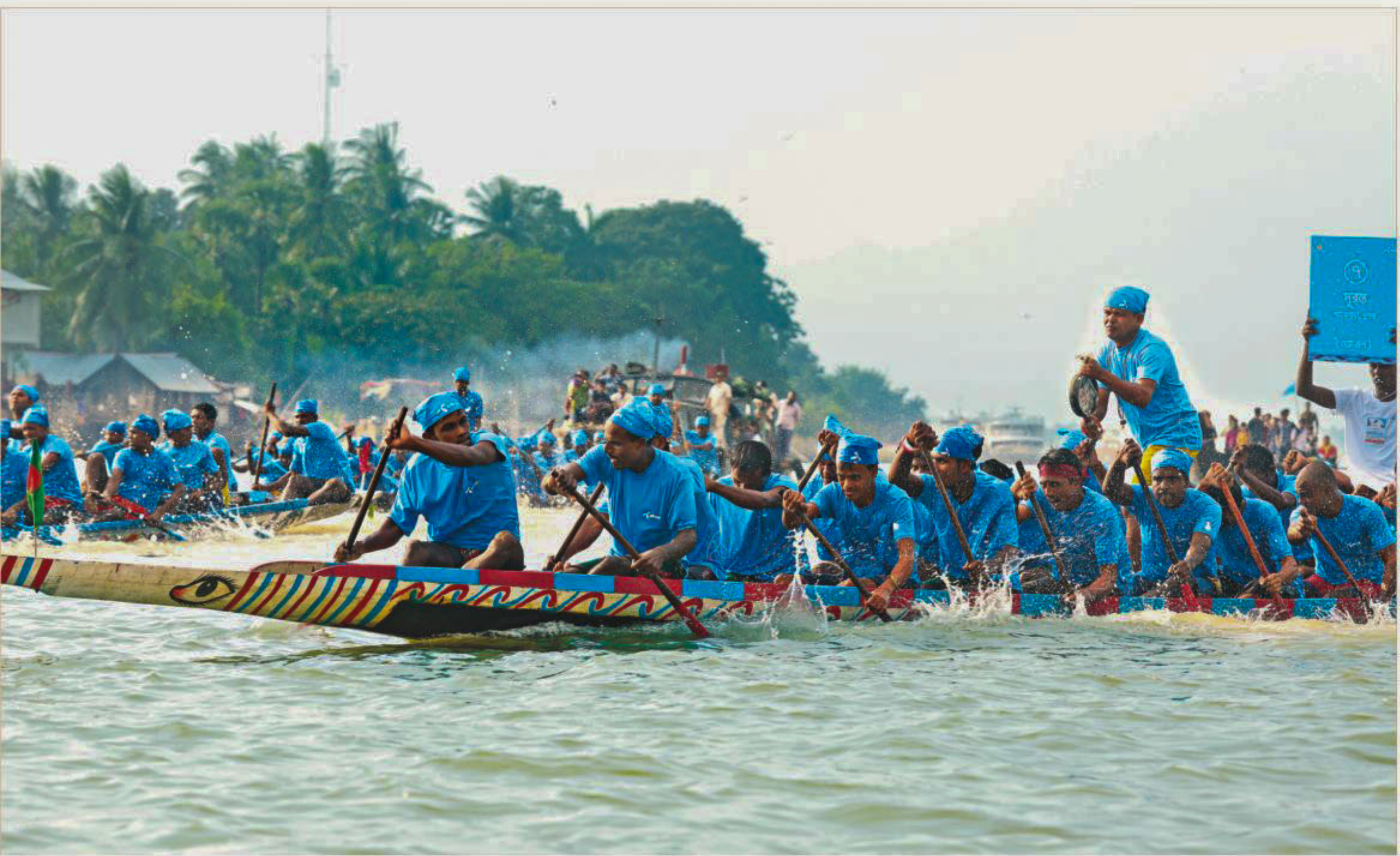
Participants at a traditional boat race on the Rupsha river in Khulna yesterday afternoon. The event was held amid much festivities and enthusiasm, arranged by Nagar Samajik o Sanskritik Kendra (NSSK), Khulna, with the patronisation of Grameenphone.