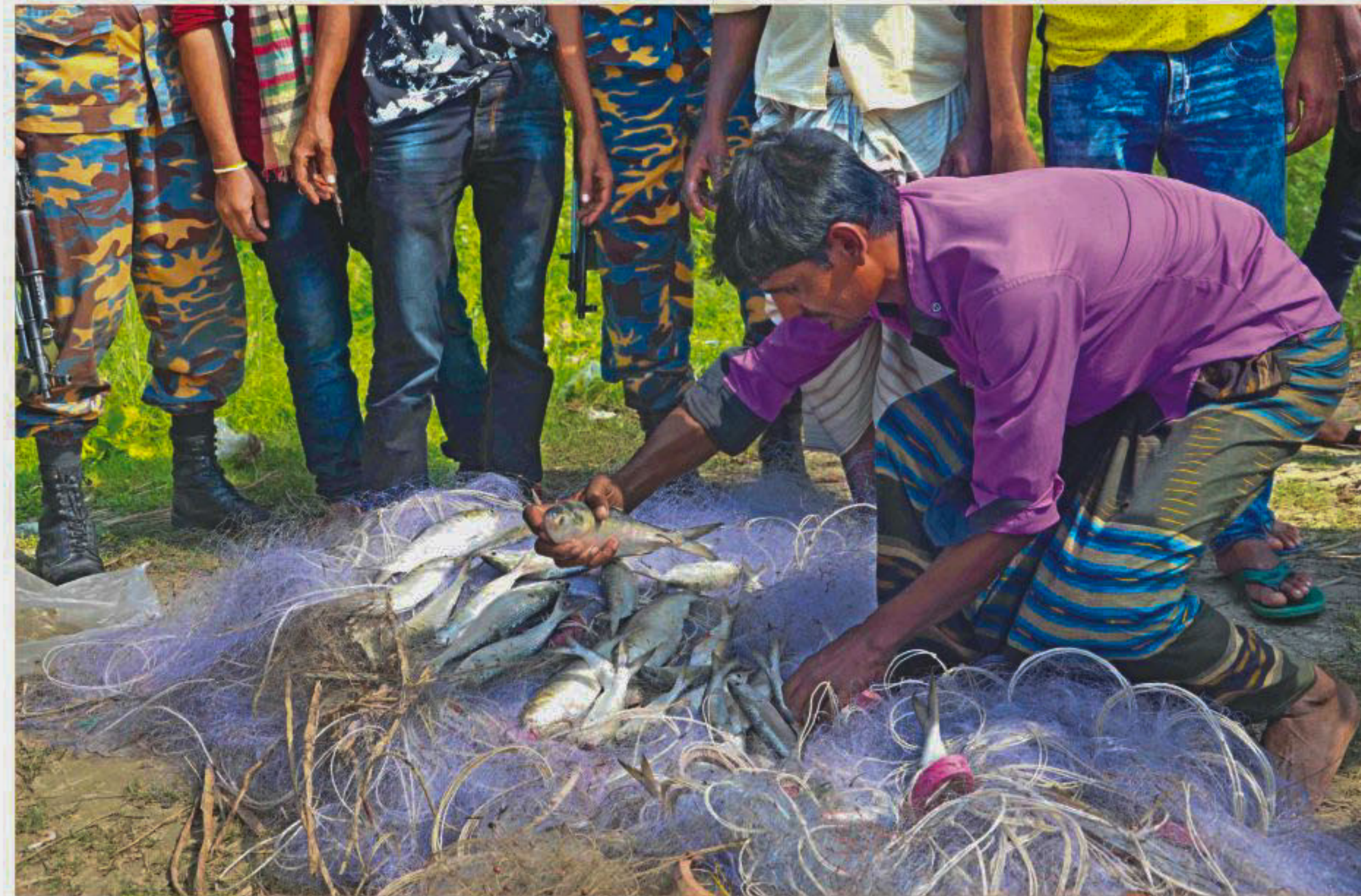
The Department of Fisheries in separate drives seized 115kg hilsa and 36,000 metres of current net in Rajshahi yesterday. Later the fish were distributed to orphanages and the nets were burnt. The photo was taken near the Padma riverbank in Rajshahi city.