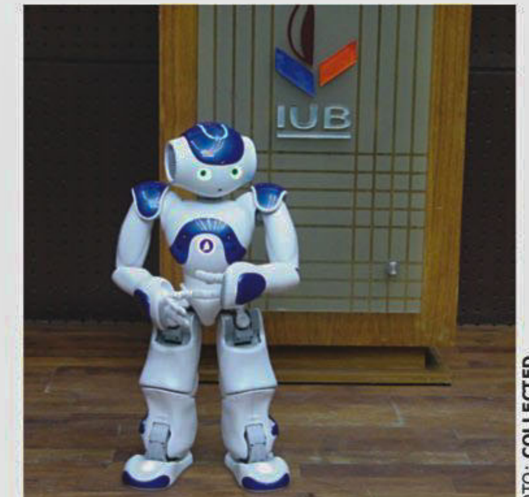
The autonomous programmable humanoid robot "NAO" in a stall during Digital Fair 2016 at Independent University, Bangladesh (IUB).

The university's EEE students are currently engaged in robotic research using the powerful NAO platform to improve human-robot interactions.