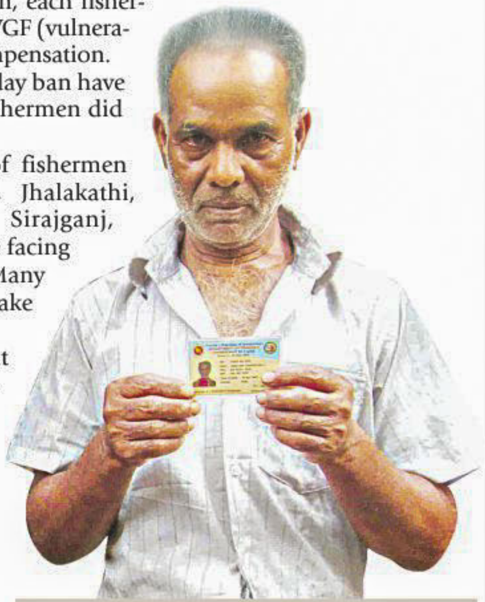
A fisherman holding his registration card