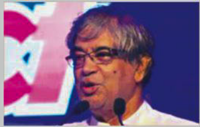
AMA MUHITH FINANCE MINISTER

"This award is putting us in a dignified position. It is a pioneering initiative."