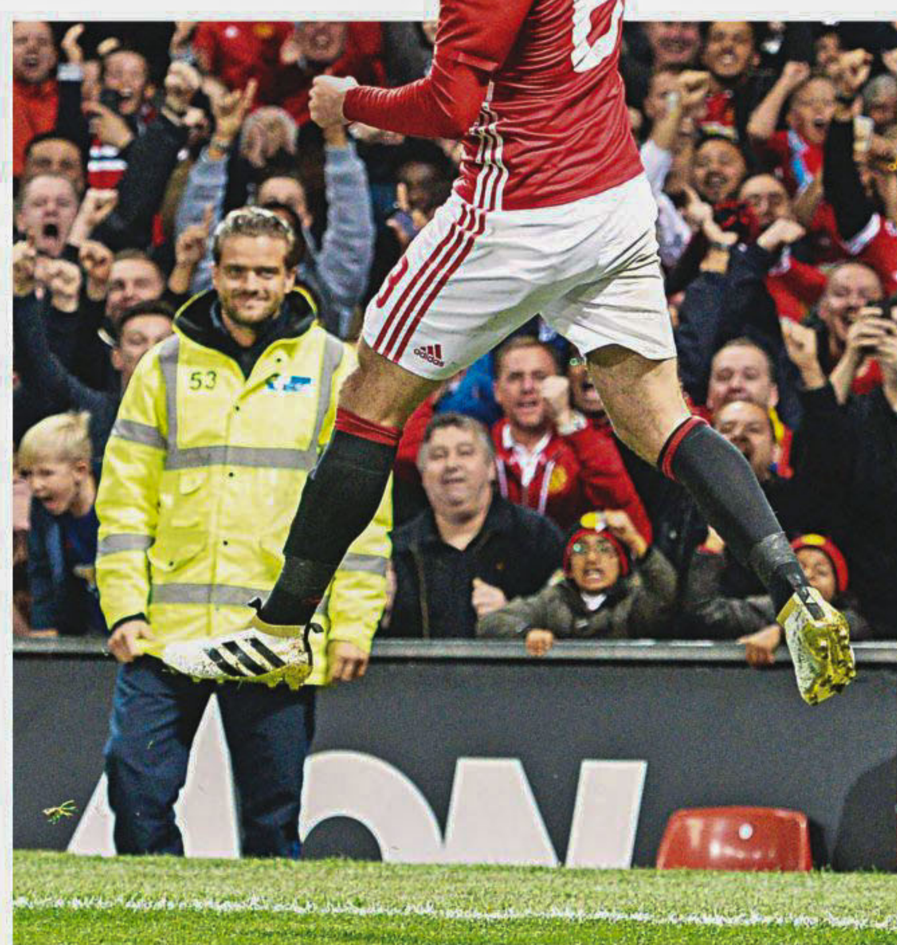
Manchester United midfielder Juan Mata jumps for joy after scoring the all-important goal against Manchester City during their EFL Cup fourth round match at Old Trafford on Wednesday.

The 53-year-old has until on Monday to respond to the charge.