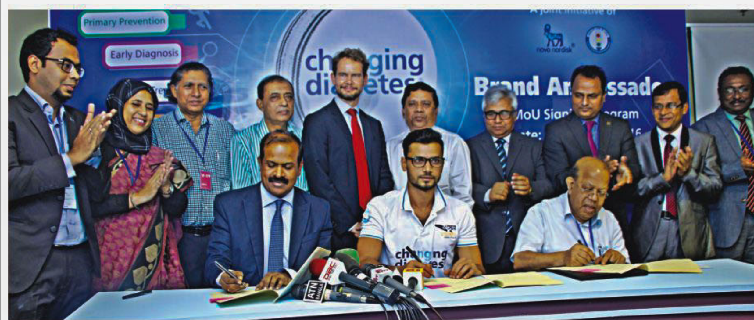
Bangladesh skipper Mashrafe Bin Mortaza (C) signed an MoU with the Diabetic Association of Bangladesh and Novo Nordisk in Dhaka yesterday in a bid to carry out a campaign to deal with diabetes. Novo Nordisk has had a partnership with Transcom Distribution Company since 2006.

"But we are still getting to know each other, still improving and we will (improve)."