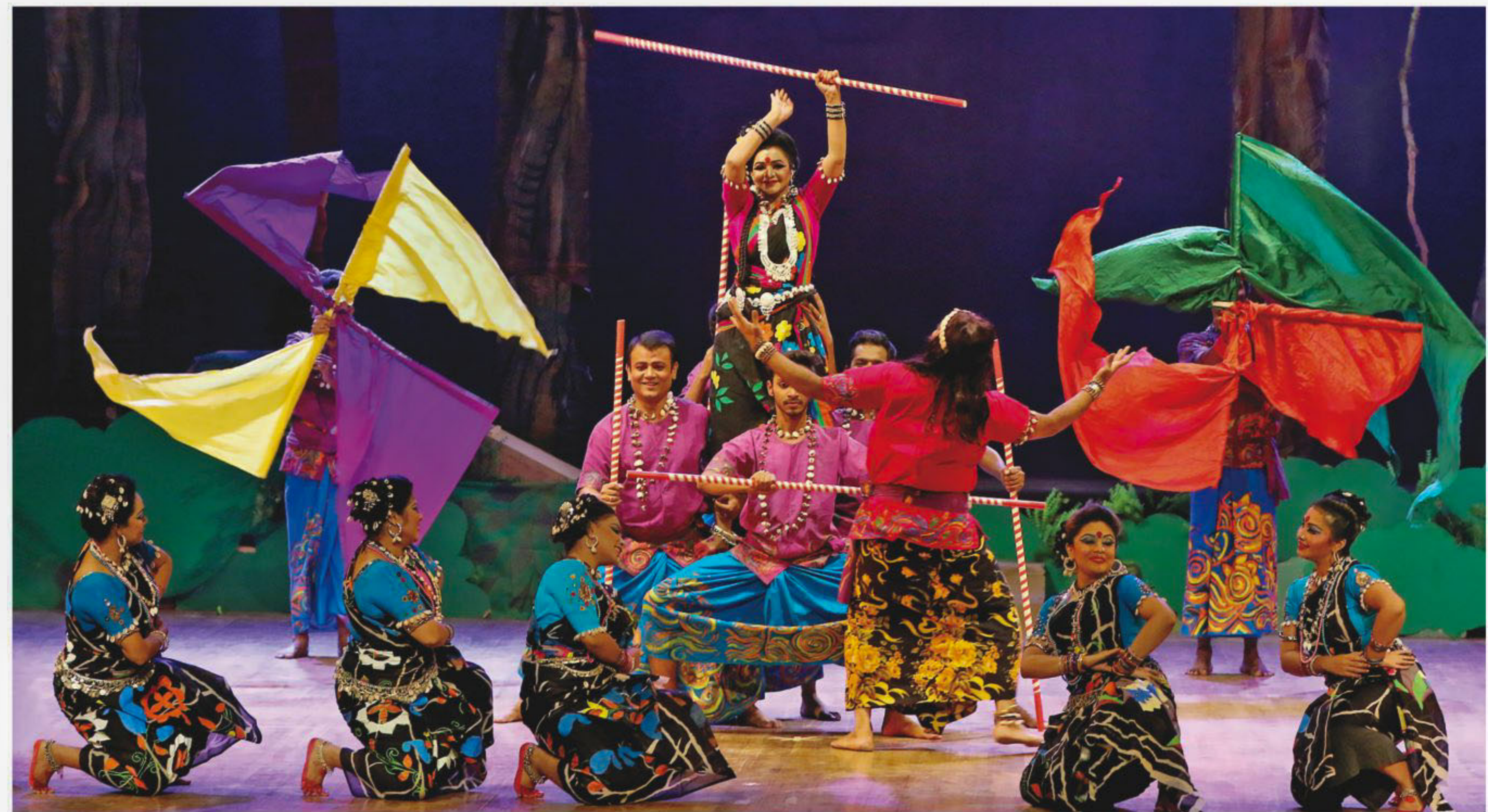
The chemistry between Shibli-Nipa (above) and the colourful chorus pieces made "Mahua" an enjoyable production.