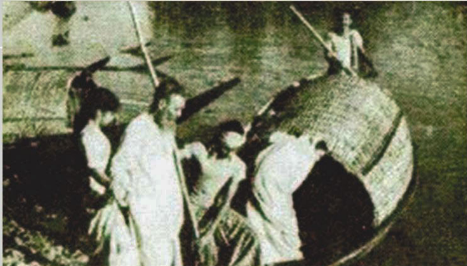
A still from "Mukh O Mukhosh", the first cinema from Dhaka.