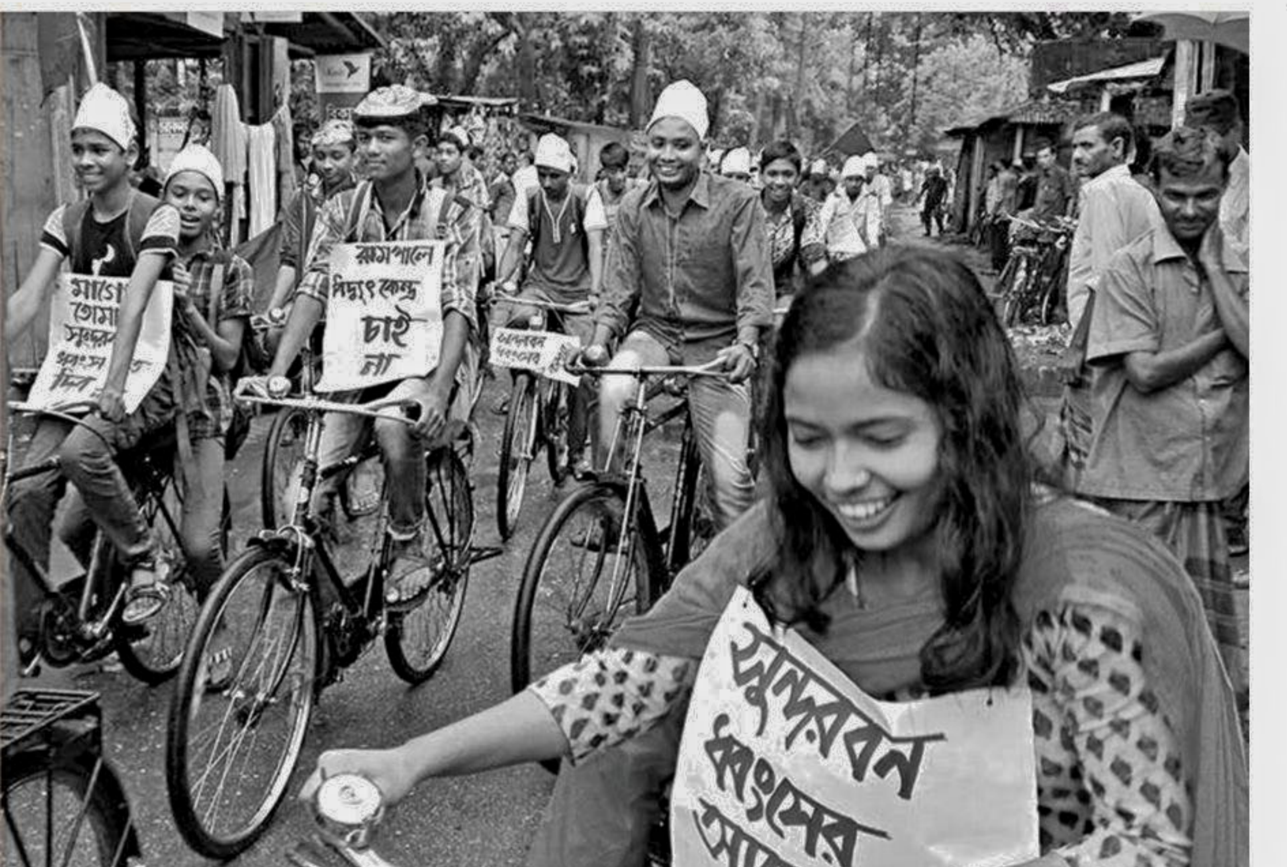
The Sundarbans Protection Movement Committee in Gaibandha held a bicycle procession in the town yesterday, protesting construction of Rampal power plant.