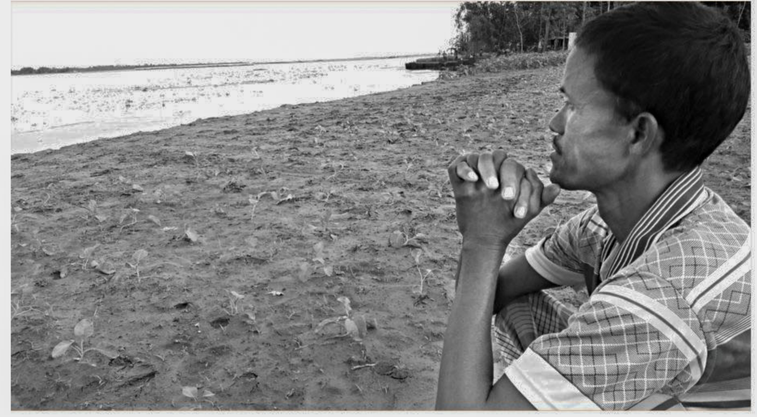
A farmer looks sorrowfully at the Dharla river that devoured his vegetable field in Baparitari village in Mogholhat union under Lalmonirhat Sadar upazila.