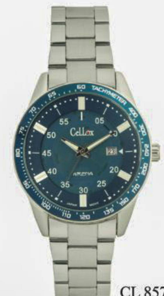
CL 857 TM