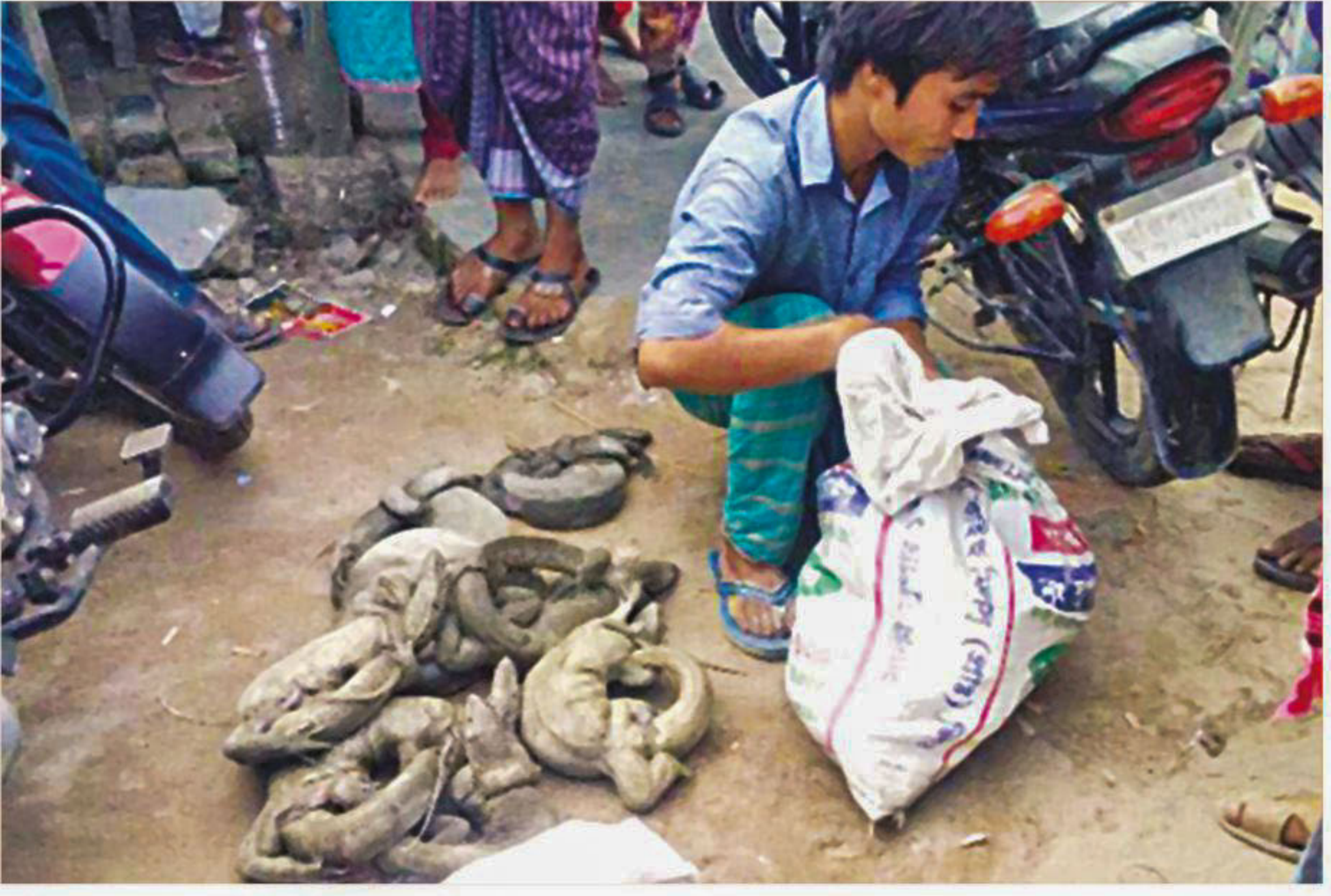
Locals caught two Rakhaine youths from Jainkathi area of Patuakhali town along with 13 monitor lizards (guisap) yesterday and handed them over to the police. Later they were produced before Sadar upazila nirbahi officer (UNO) who released the duo after learning that lizards are Rakhaine community's favourite food item.