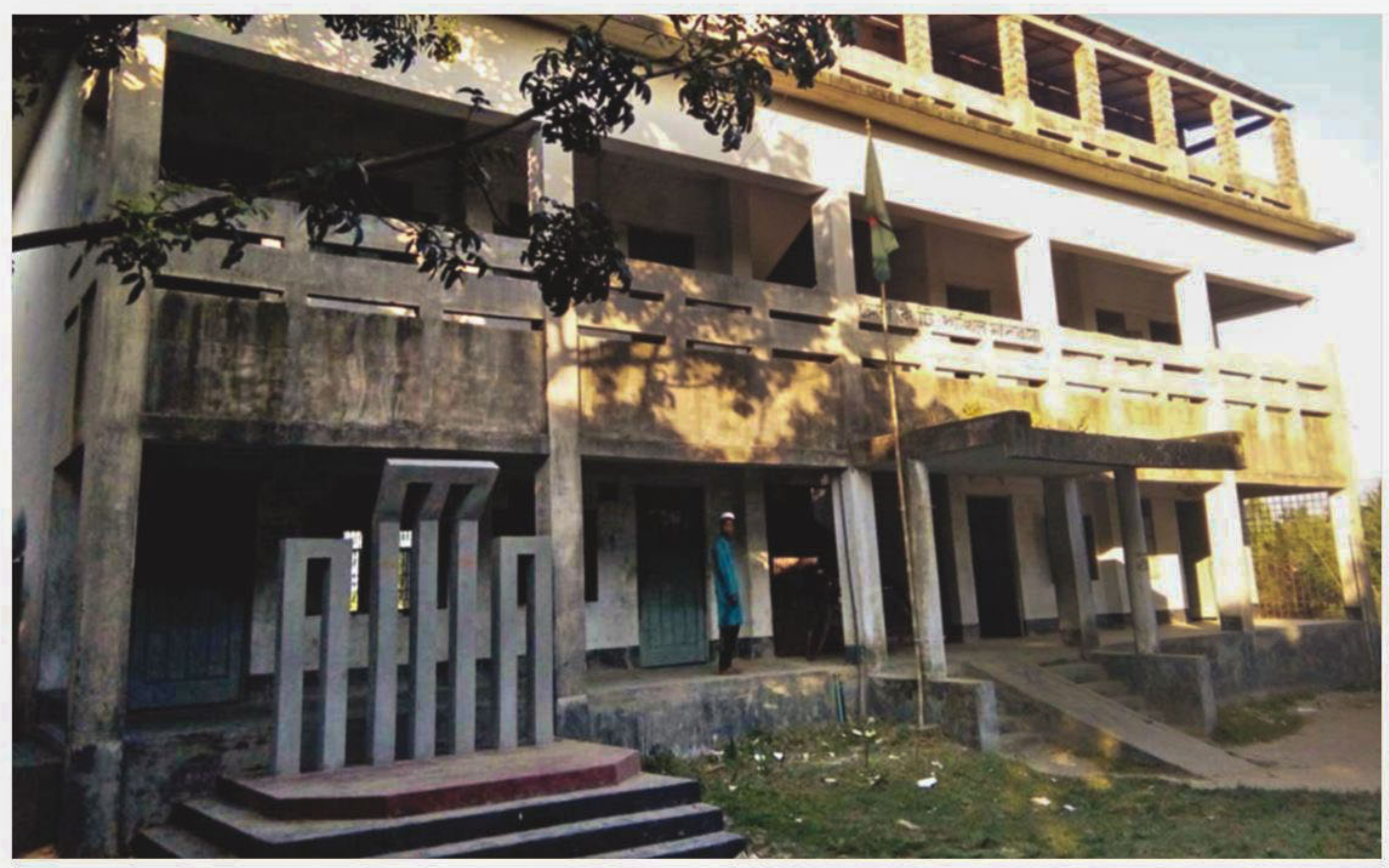
This newly built Shaheed Minar at Demra Kaderia Tayeba Dakhil Madrasa in Faridpur upazila of Pabna is one of the 2,800 Shaheed Minars to be built in educational institutions in the district by the end of the month.

OUR CORRESPONDENT, Lalmonirhat Authorised dealers in Sadar upazila of the district are allegedly selling fifty percent allocated ata (flour) meant for Open Market Sale (OMS) on the black market, depriving the ultra poor beneficiaries of the programme. Although some of the beneficiaries manage to purchase the ata from the government authorised outlets but a good number of people return empty handed everyday. A number of beneficiaries alleged that one kg ata is priced Tk 17 at OMS outlets, but the dealers sell it at Tk 23-24 on the black market which earned them an additional profit of Tk 5-6 illegally. Asgar Ali, 45, a day labourer of Nayarhat area in the town, alleged that he went to purchase ata at an OMS outlet yesterday noon but returned home empty handed as the dealer stopped its sales, saying that the stock for the day was finished. Sources at the district food office said the government launched open market sale of ata through 11 OMS outlets in the district. Each dealer gets 1,000 kg ata every day to sell it among the beneficiaries. Every card holder can buy 5 kg of the item. Abdur Rahim, a dealer in Banbhasa area of the town, said as the ultra poor people gathered in front of his OMS outlet early in the morning every day. There is no scope to sale the item on the black market before everyone's eyes. Besides, the officials of the district food department monitor the outlet throughout the day, he said.