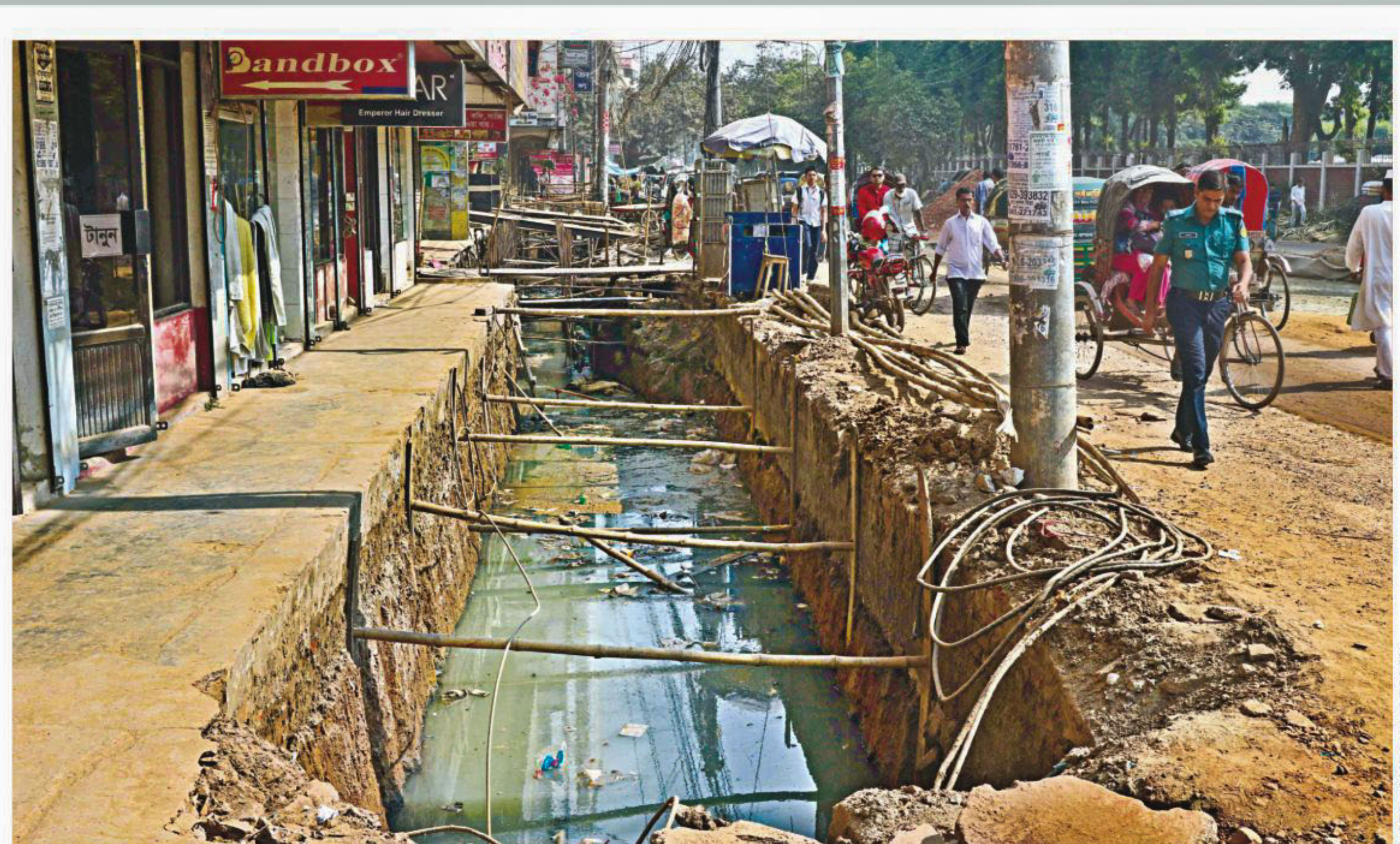
The road near Rajarbagh Police Lines in the capital has been left like this for around three months for the development work of the area's drainage system. People have to go through huge sufferings while negotiating the road on foot or in vehicles. The development work is also affecting the local businesses as the owners are facing losses due to the present condition of the road. The photo was taken on Tuesday.

The JSC and JDC examinations will begin on November 1. The examinations will be held simultaneously at 2,734 centres across the country with 24.1 lakh students from 28,844 educational institutions registered to sit for the examinations.