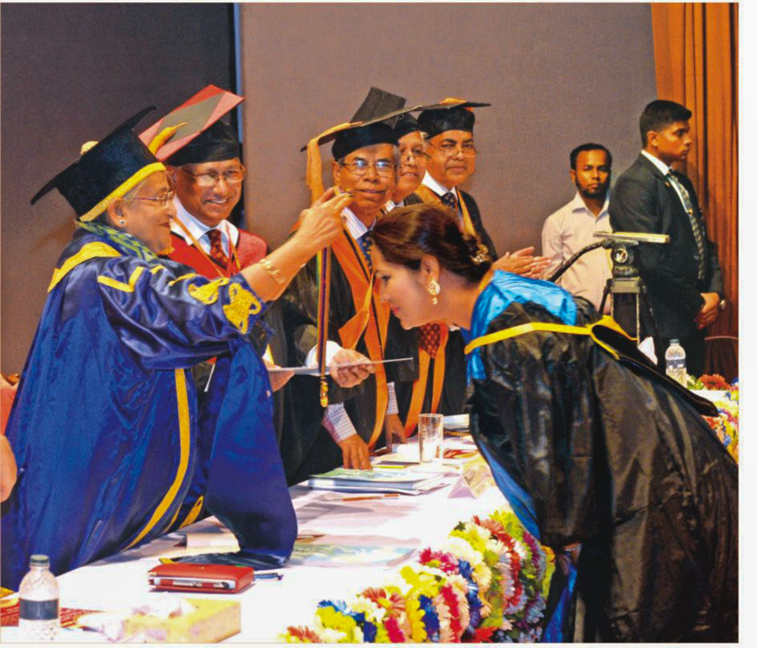
Prime Minister Sheikh Hasina presenting a medal to a graduate at the 13th convocation of Bangladesh College of Physicians and Surgeons at the capital's Krishibid Institution Bangladesh yesterday.