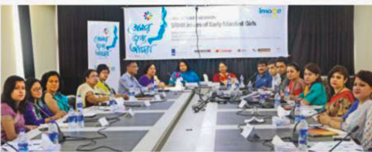
Participants at a discussion at The Daily Star Centre yesterday.

The study was funded by the Dutch government under the project Initiatives for Married Adolescent Girls' Empowerment (IM-AGE).