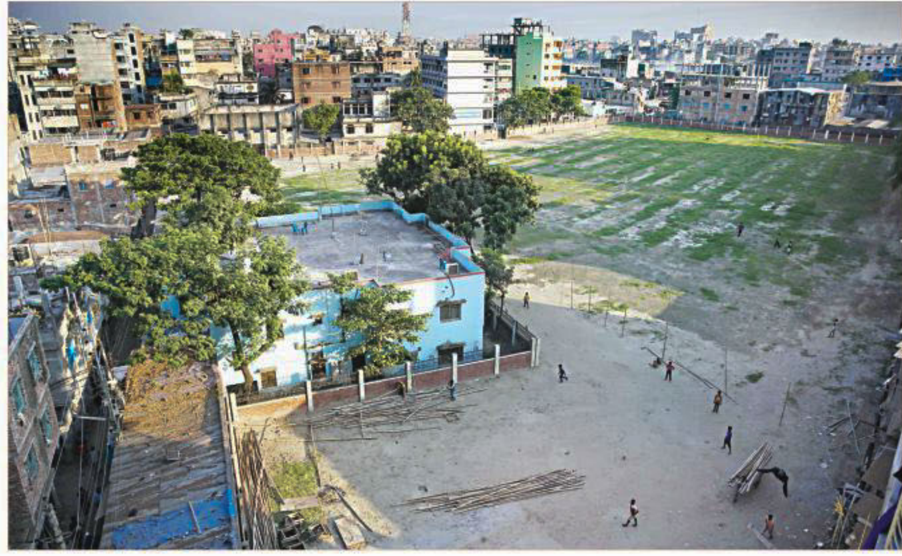
A non-descript two-storey building and a bare training ground at the southern part of Old Dhaka is the home to Rahmatganj MFS club, who are being dubbed as the Leicester City of Bangladesh this season for their phenomenal run in the Bangladesh Premier League.

With an age-old reputation as giant-slayers and often criticised as the ringleader of 'trading points', the club from the southern part of Old Dhaka are the surprise title contenders in the Professional Football League, finishing two points behind leaders Chittagong