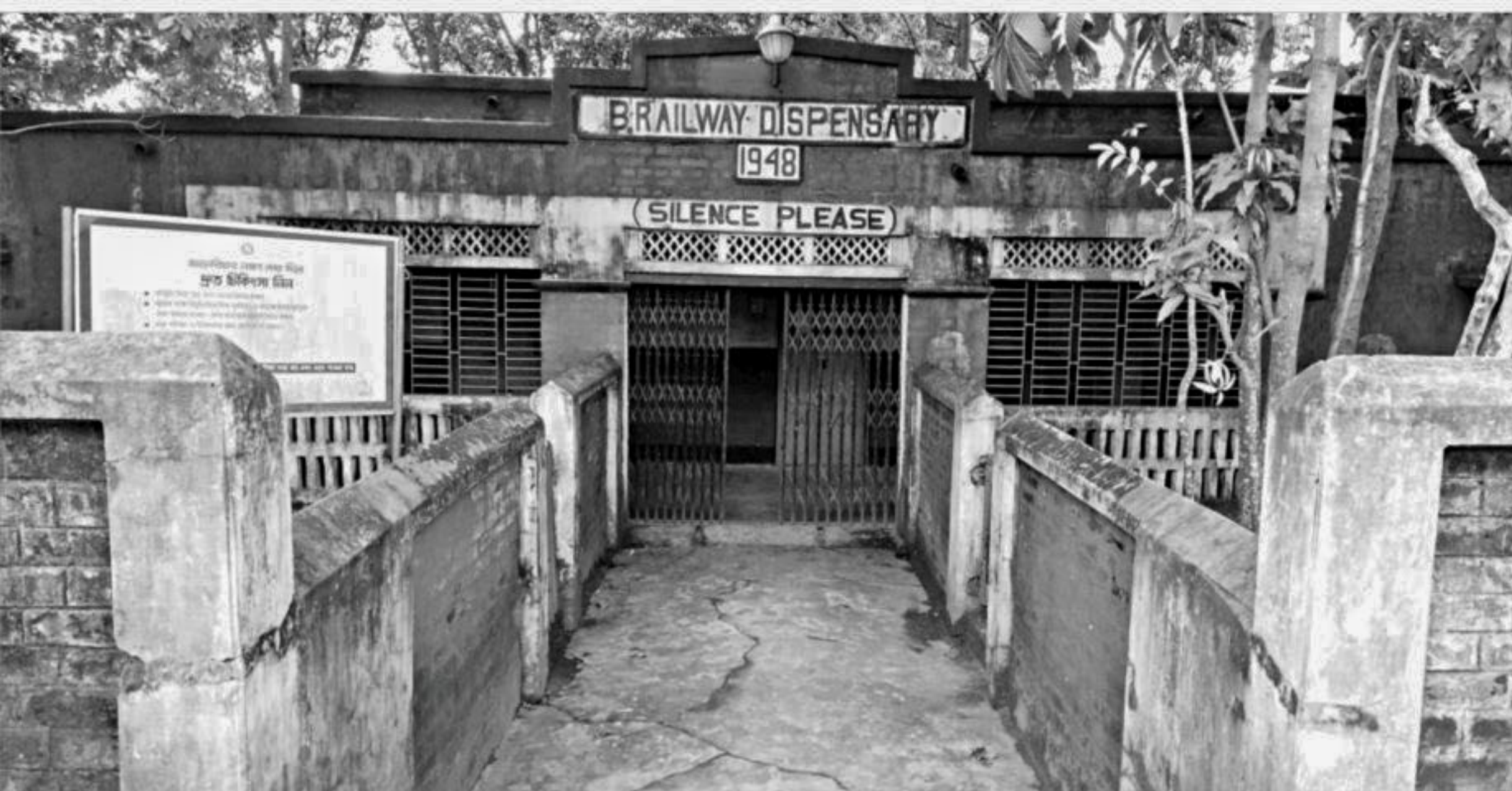
Kulaura railway dispensary in Moulvibazar. The photo was taken recently.