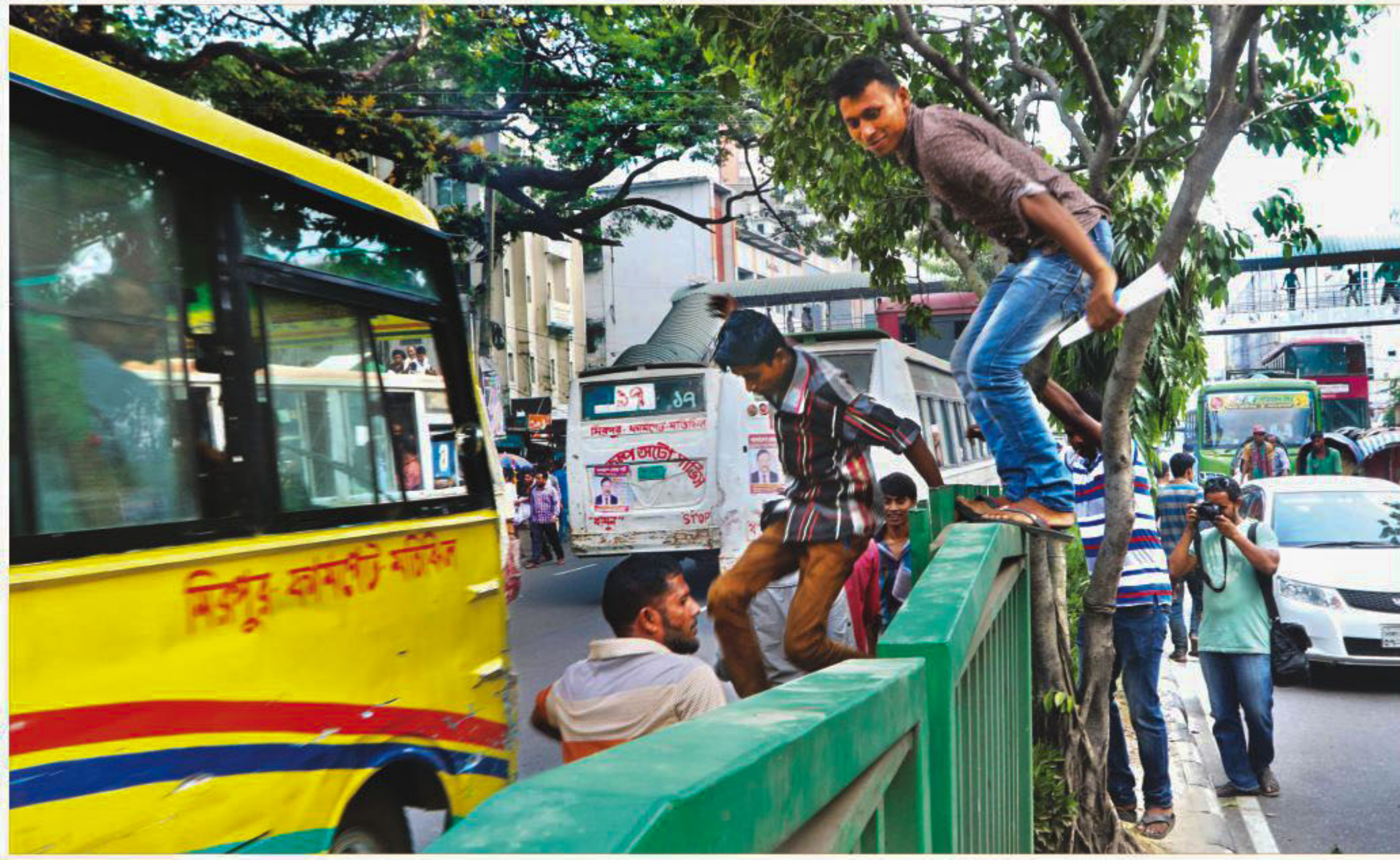
Ignoring oncoming traffic, people jump over the guard rail on the central reservation of Tophkhana Road in front of the Jatiya Press Club to cross the street. There is a footbridge just a few yards away. The photo was taken recently.