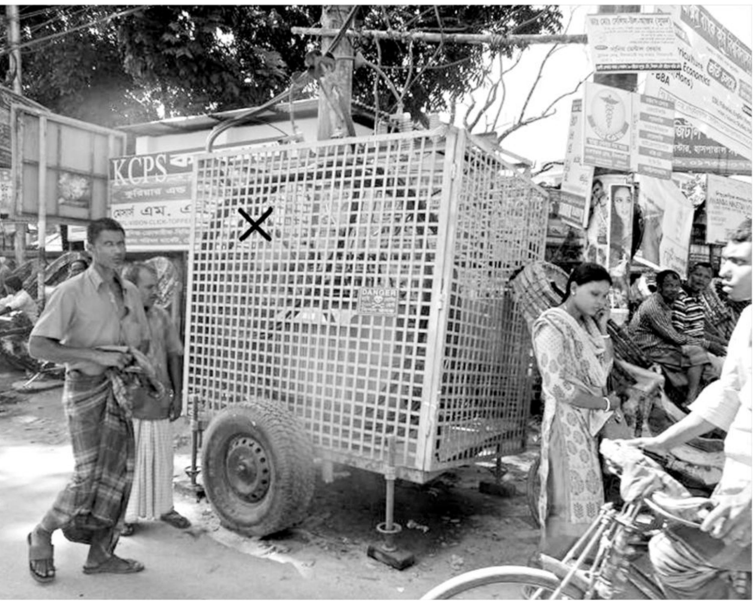
An 11kV transformer set up at Chowrangi intersection in Nilphamari town poses risk of fatal accidents to pedestrians, thanks to the callousness of the authorities.