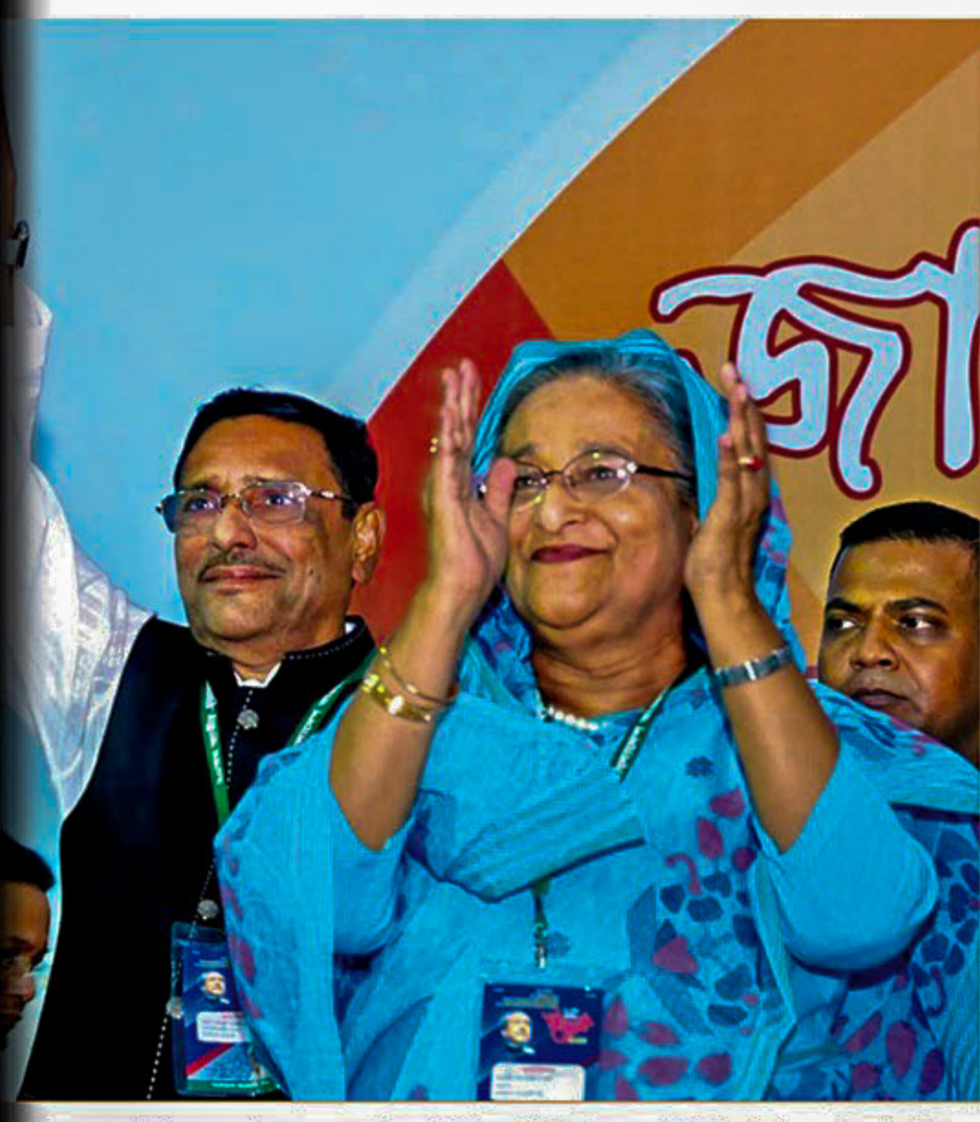
Prime Minister Sheikh Hasina, and her predecessor Syed Ashrafur Islam with their hands aloft, clapping for the eighth time in a row, after the new leadership was inaugurated at the Institution of Engineers, Bangladesh (IEB) in the capital yesterday.