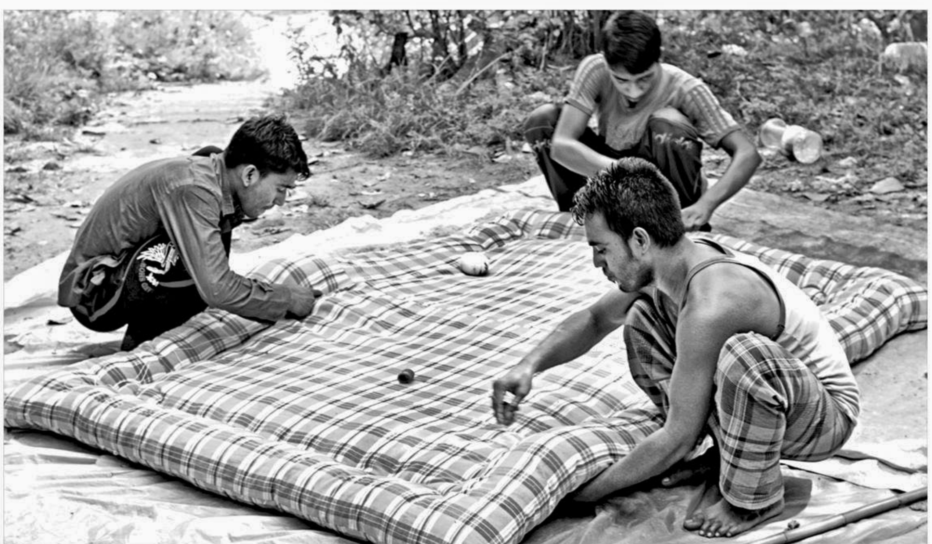
With winter approaching, quilt makers in Sylhet are passing busy time as demand for the item in the area sees rise. Prices of the quilt vary depending on the size and quality of the cotton. A double-sized quilt costs around Tk 800 to Tk 1,700 while a single-sized one costs Tk 500 to Tk 900. The photo was taken in Madina Market area of Sylhet city recently.