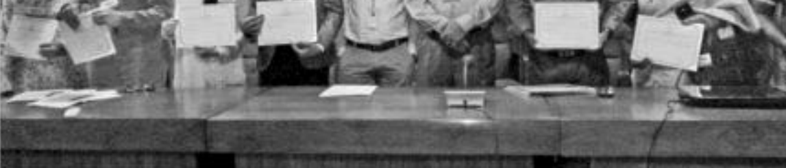
The certificate distribution ceremony for graduates of IDB-BISEW IT Scholarship Project in Dhaka.

IDB-BISEW was established following an agreement between IDB, Jeddah, Saudi Arabia, and the Bangladesh government.