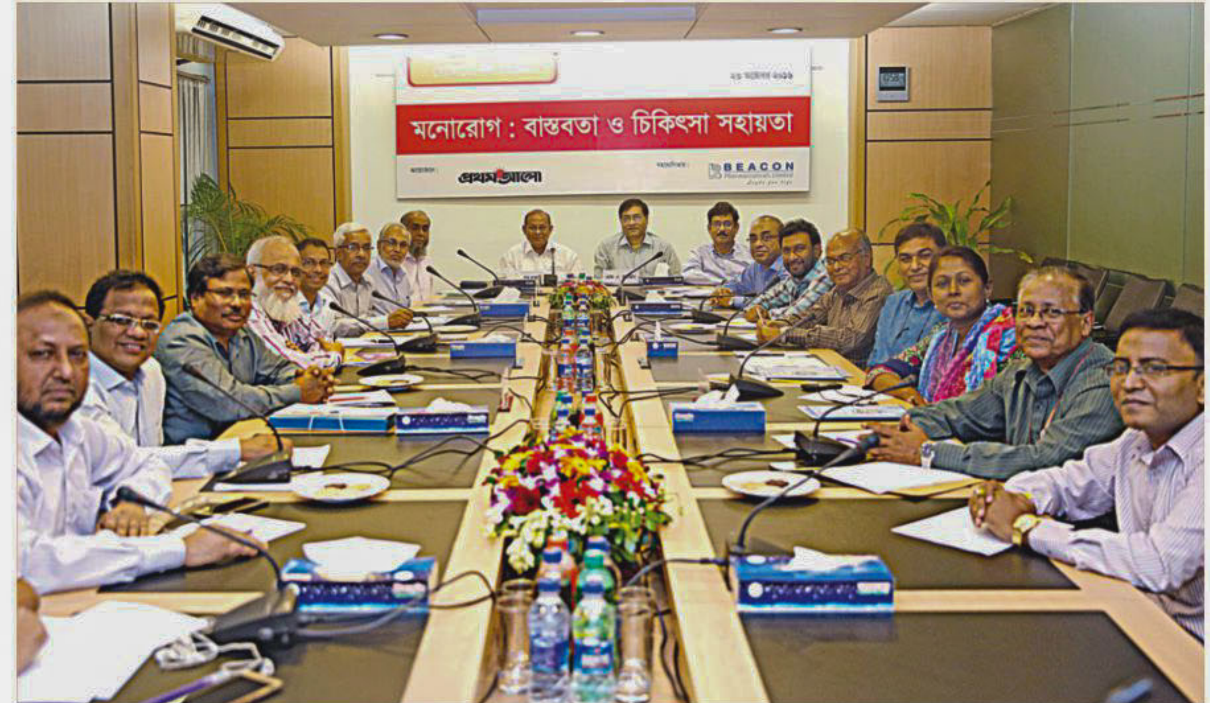
Participants at a roundtable conference titled "Mental diseases: Reality and support for treatment", organised by the Prothom Alo in association with Beacon Pharmaceuticals Ltd, at the newspaper's office in Dhaka yesterday. The discussants, including doctors of different medical colleges and mental health experts, underscored, among others, the need for a change in people's negative attitudes towards mental illness and awareness about the issue. They also demanded that a psychiatric unit to widen the health service be launched at the public and private medical college hospitals.