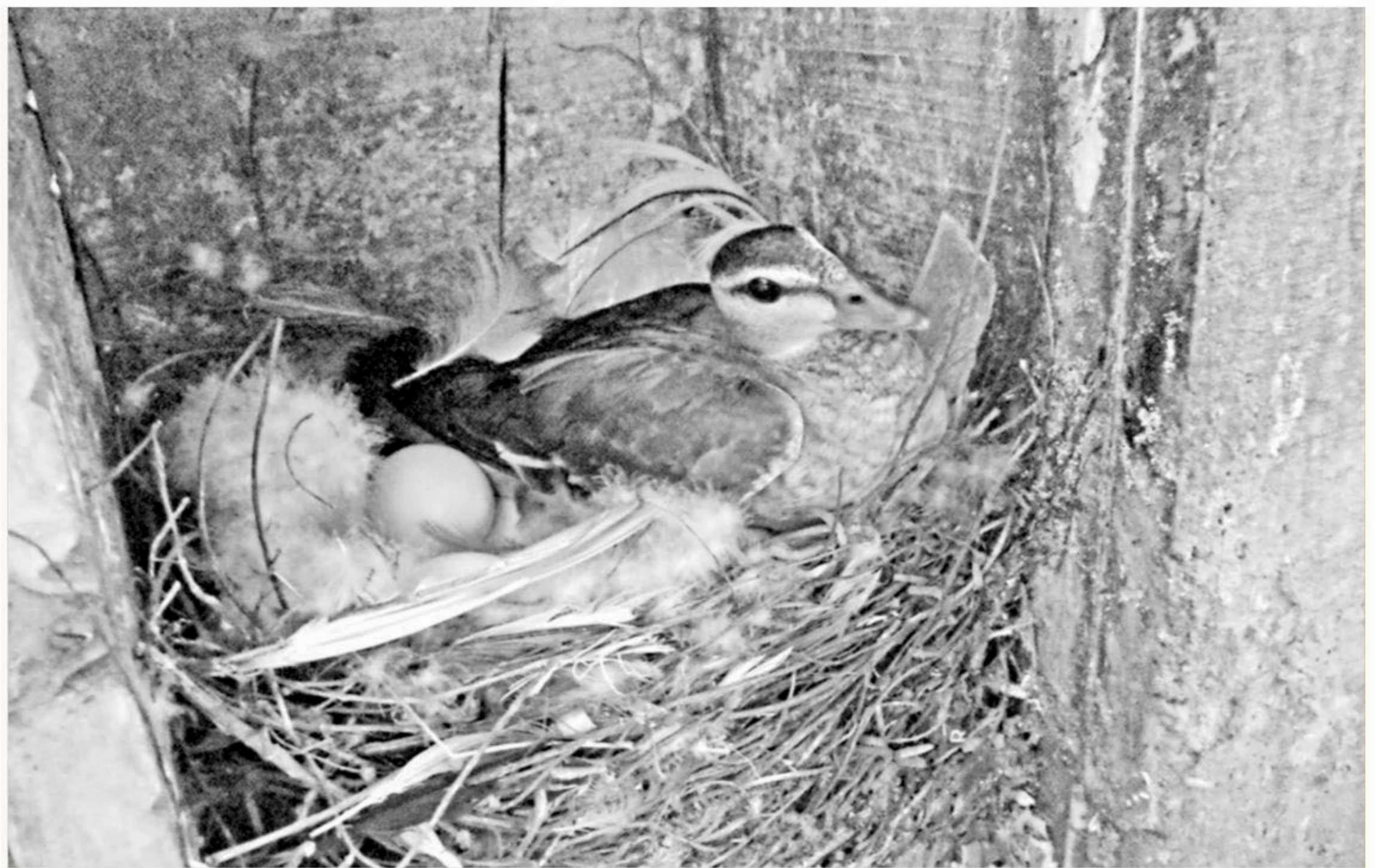
A cotton pygmy goose hatching eggs at a breeding nest installed on the bank of Baikka Beel in Moulvibazar.