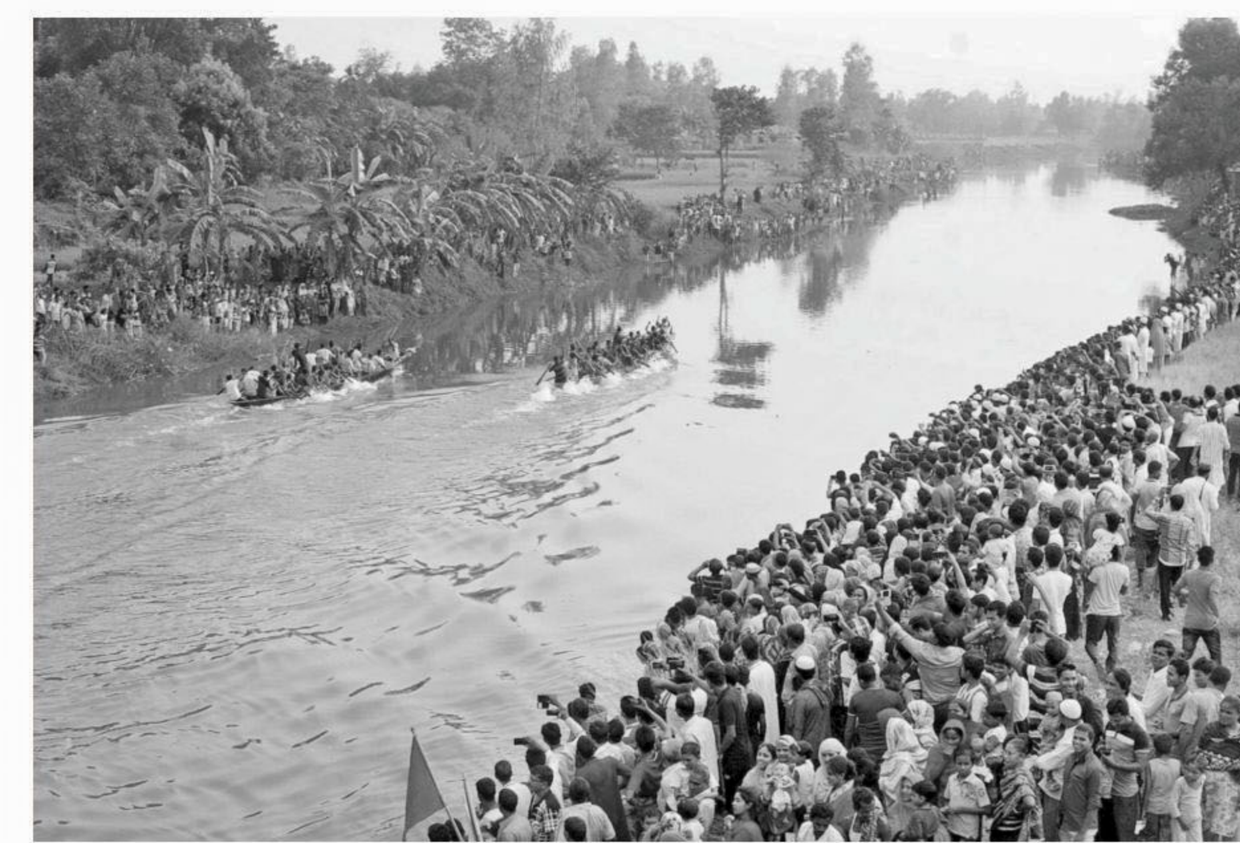
People under the banner of 'Bangladesh Gram Theatre' and 'Bejora Jubo Unnayan Sangha' organised a boat race in the Karatoa river from Bhatkandi to Defoitola under Shahjahanpur upazila in Bogra on Friday to create awareness about saving the river from mindless grabbing and pollution.