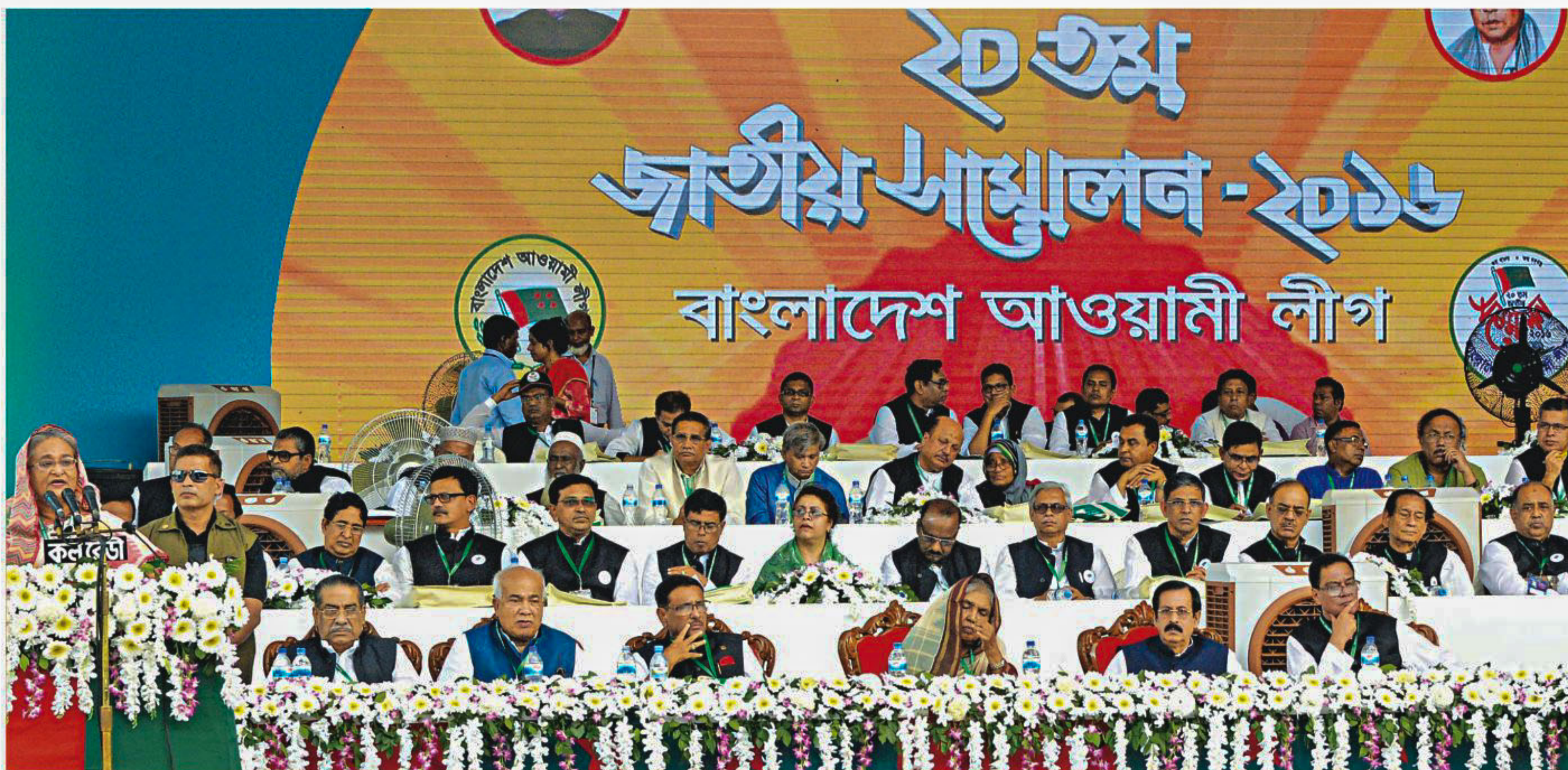
Sheikh Hasina, chief of Awami League, addresses the party's 20th National Council at the historic Suhrawardy Udyan in the capital yesterday. Senior AL leaders are also seen on the stage.