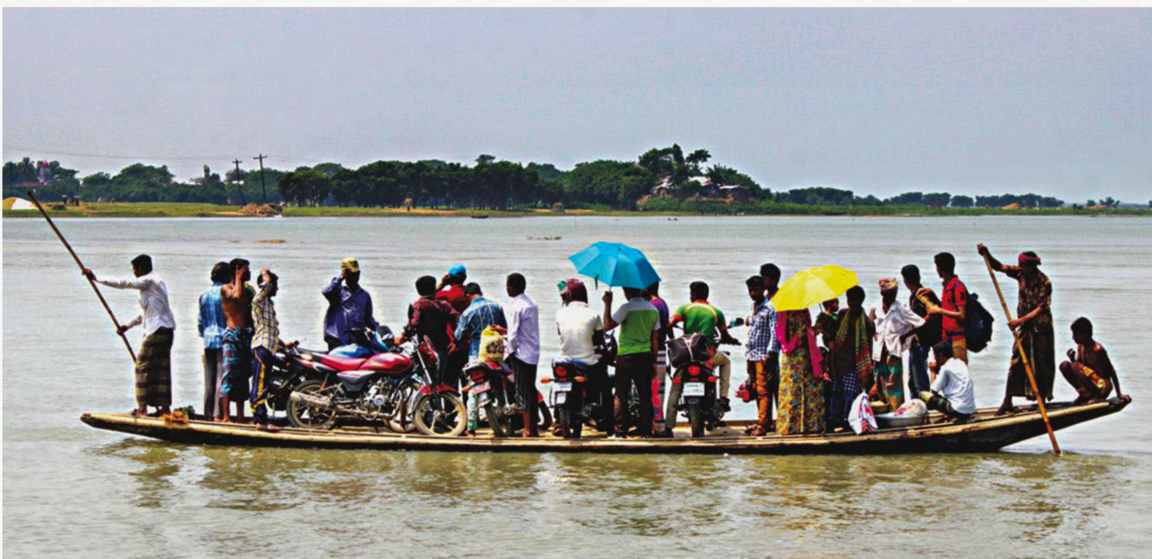
A boat ferries people across the Jadukata river in Sunamganj, which was supposed to have a bridge by now. Five lakh people from Tahirpur, Dharmapasha, and Bishwambharpur make six crossings by boat in the river to commute between Pathanpara and Miyarchar. A project for construction of the 750 metre bridge has already been approved by Ecneec, but it remains stuck in the LGED bidding process, said local public representatives. During a public rally in 2010, Prime Minister Sheikh Hasina promised to build a bridge over the river. The photo was taken last week.