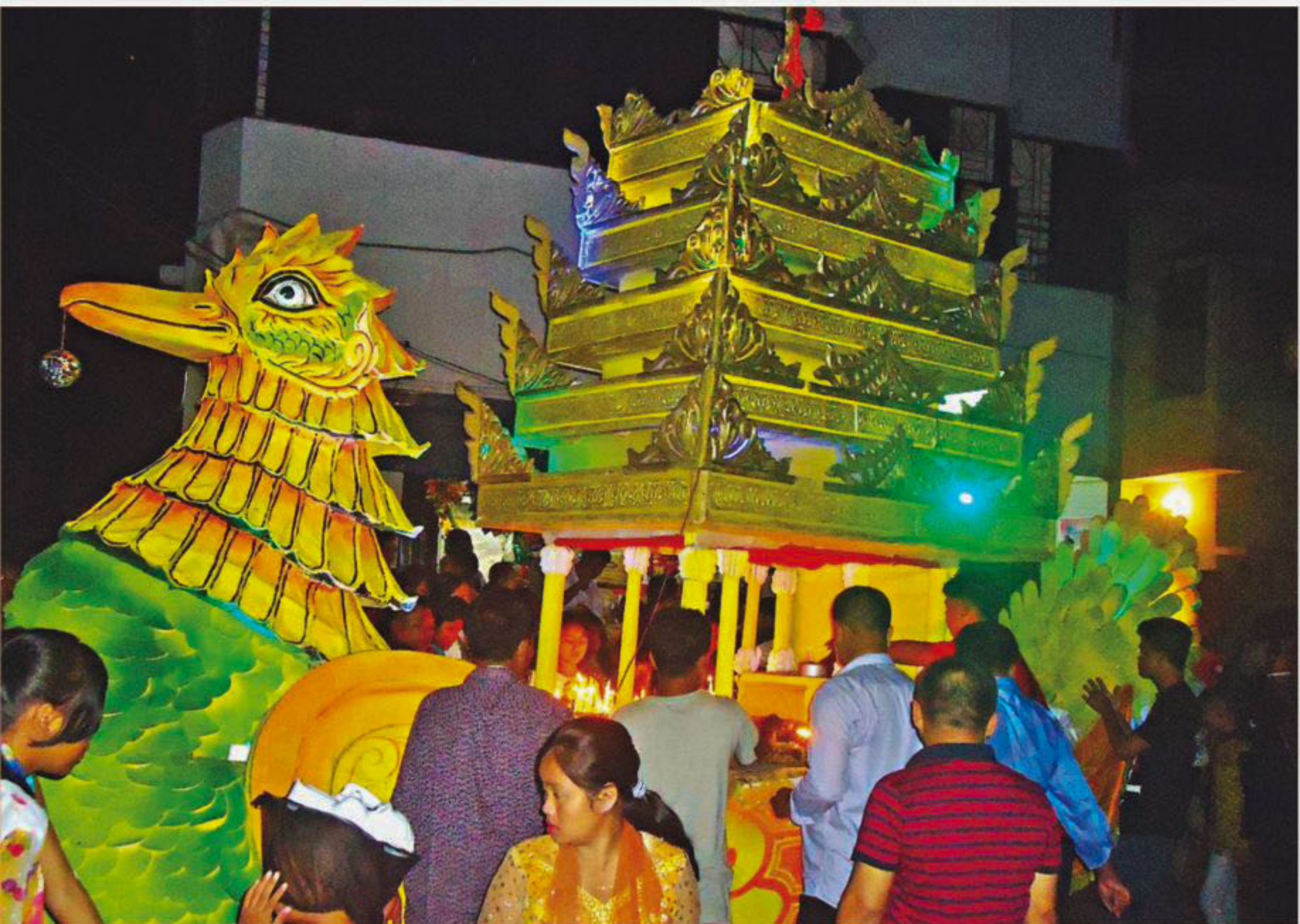
People gather around a colourful chariot at the indigenous Buddhists' festival of "Mahaa Wagyawai Powe" in Bandarban town last evening. Paper lanterns (fanus) are also released on the occasion.