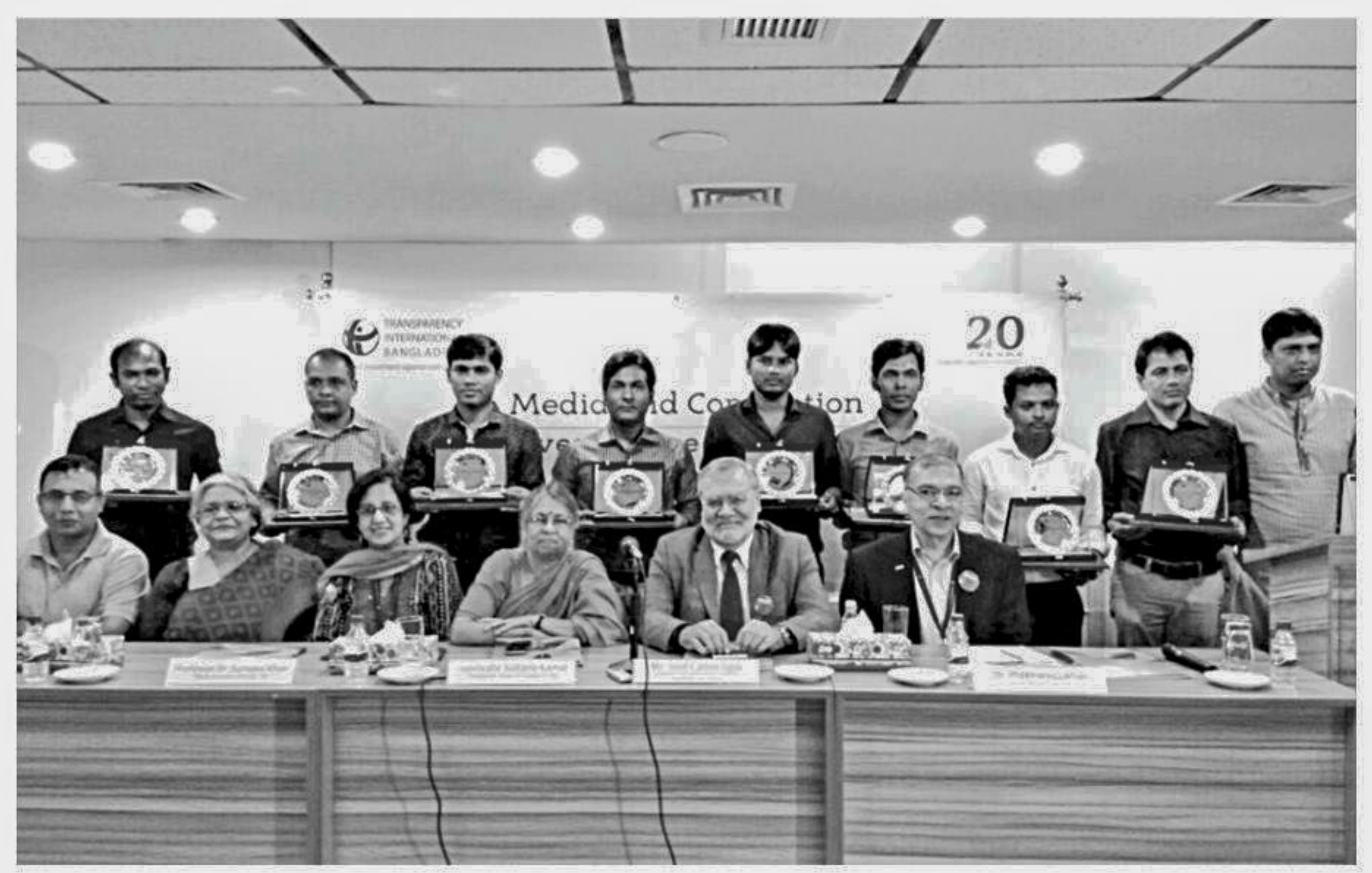
Recipients of "Investigative Journalism Awards-2016" with guests in the awards giving ceremony at the office of Transparency International Bangladesh in the capital yesterday.