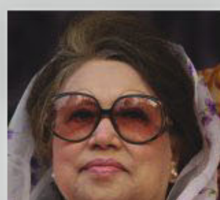
KHALEDA ZIA Prime Minister 1991, 2002, 2004, 2005, 2010, 2012