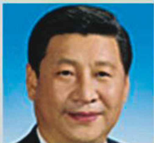
XI JINPING Vice President 2010