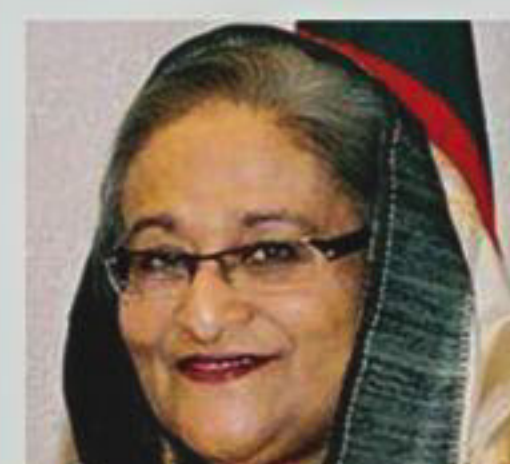
SHEIKH HASINA Prime minister 1993, 1996, 2000, 2003, 2010, 2014