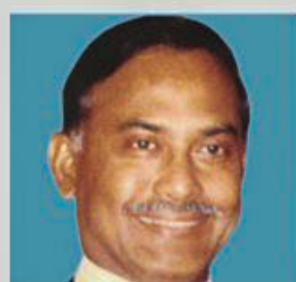
ZIAUR RAHMAN President 1977, 1980