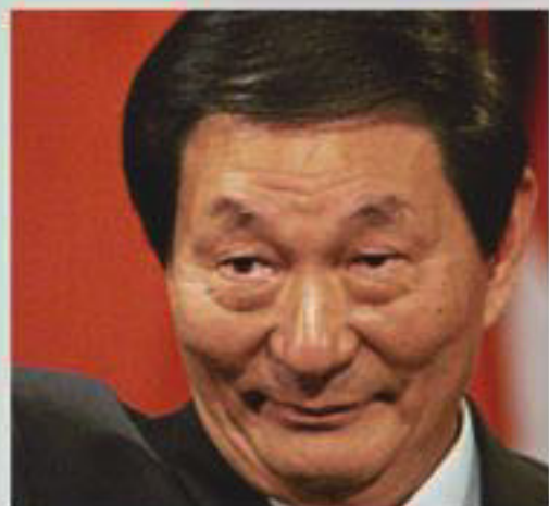
ZHU RONGJI Prime Minister 2002