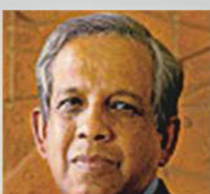
FAKHRUDDIN AHMED Chief Adviser, Caretaker Govt, 2008