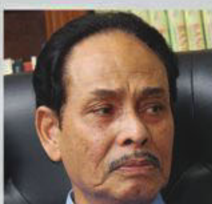
HM ERSHAD President 1982, 1985, 1987, 1988, 1990