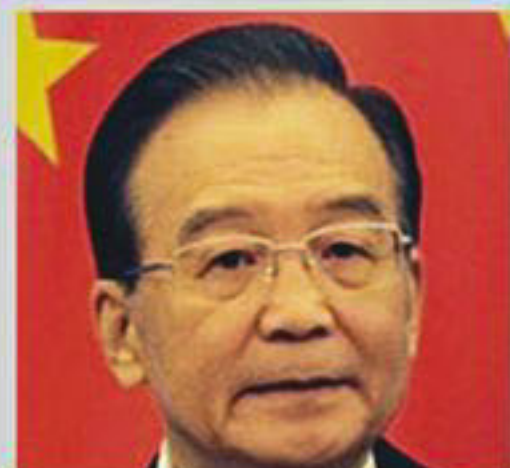
WEN JIABAO Prime Minister 2005