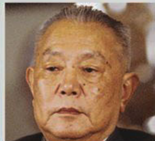
LI XIANNIAN President 1978, 1986