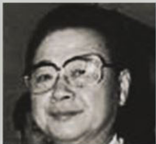
LI PENG Prime Minister 1989, 1999