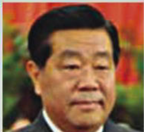
JIA QINGLIN CPC Leader 2003