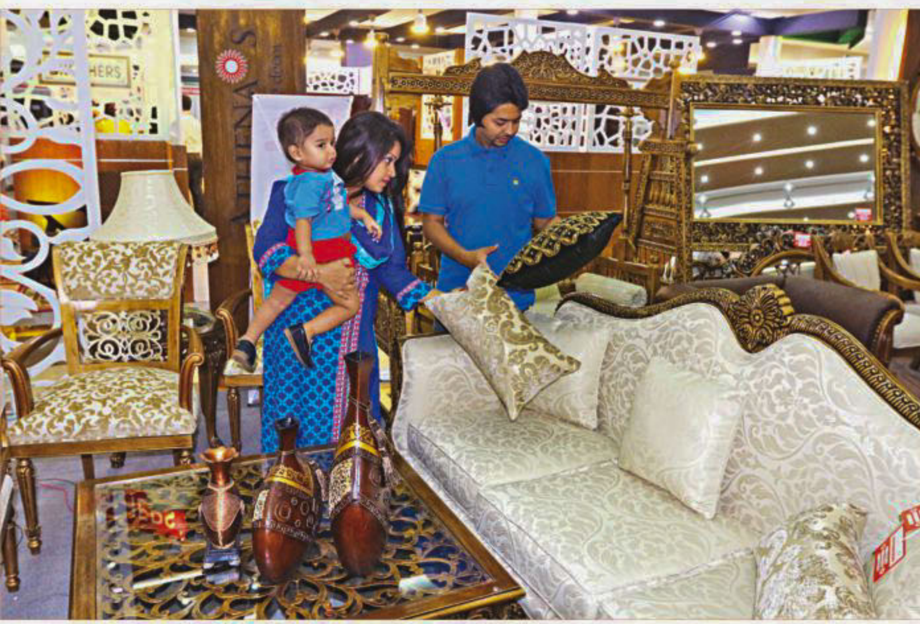
People visit a stall of the five-day furniture fair that began at International Convention Centre Bashundhara in Dhaka yesterday.