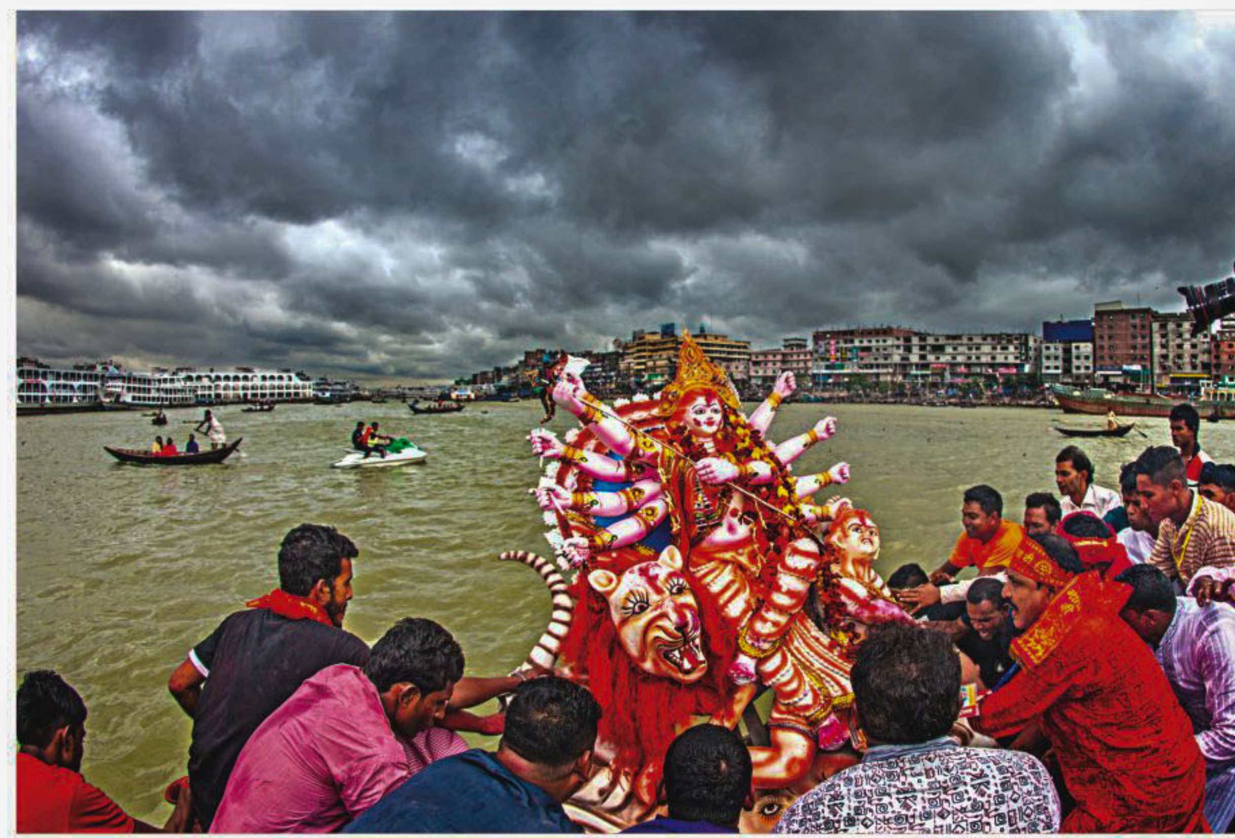
The Hindus immerse the idol of Durga in the Buriganga river near Wais Ghat yesterday. The immersion of the idols draws the curtains on Durga Puja, the biggest Hindu festival in the country.