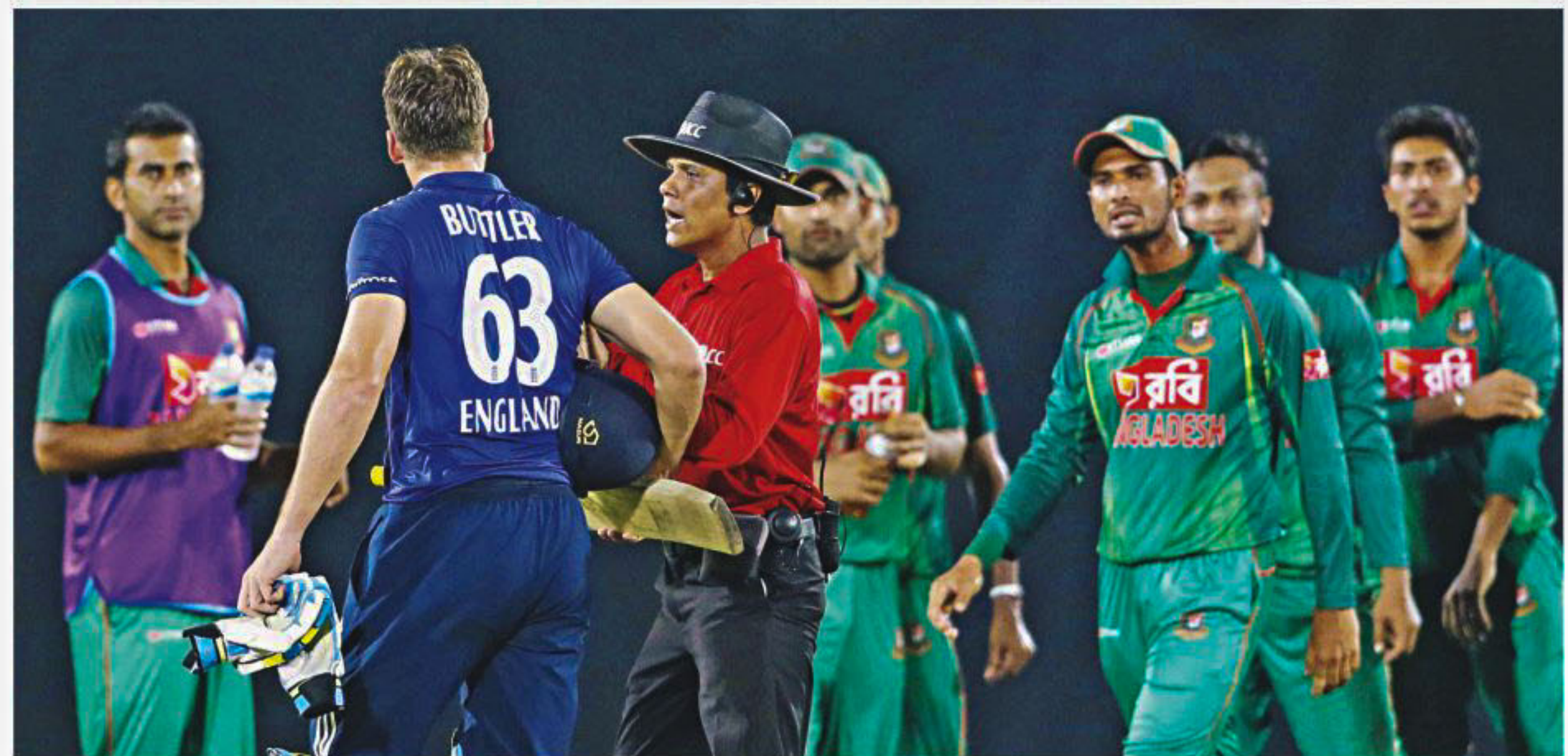
After taking the decisive wicket of Jos Buttler, the Bangladesh players celebrated fervently. The England captain took exception, and the incident added an unsavoury aspect to an otherwise highly entertaining cricket match.

"He [Mashrafe] had a really good game. He chanced his arms a little bit and was aggressive and got them up to a score maybe 20 more than what they could have gotten. He bowled well as well," said Buttler, adding that his players would remain unshaken from the defeat.