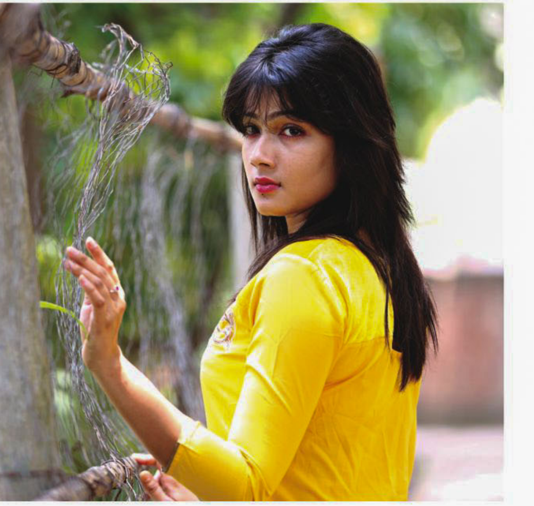
Mahi will join forces with Shaon for a second time after "Krishnopokkho".

Shaon to turn "Nokkhotrer Raat" into film