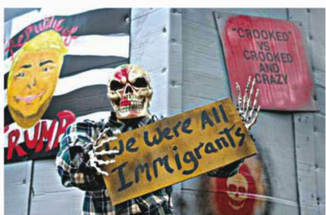
A Halloween display featuring a border wall and figures of Donald Trump, Hillary Clinton and Bernie Sanders.