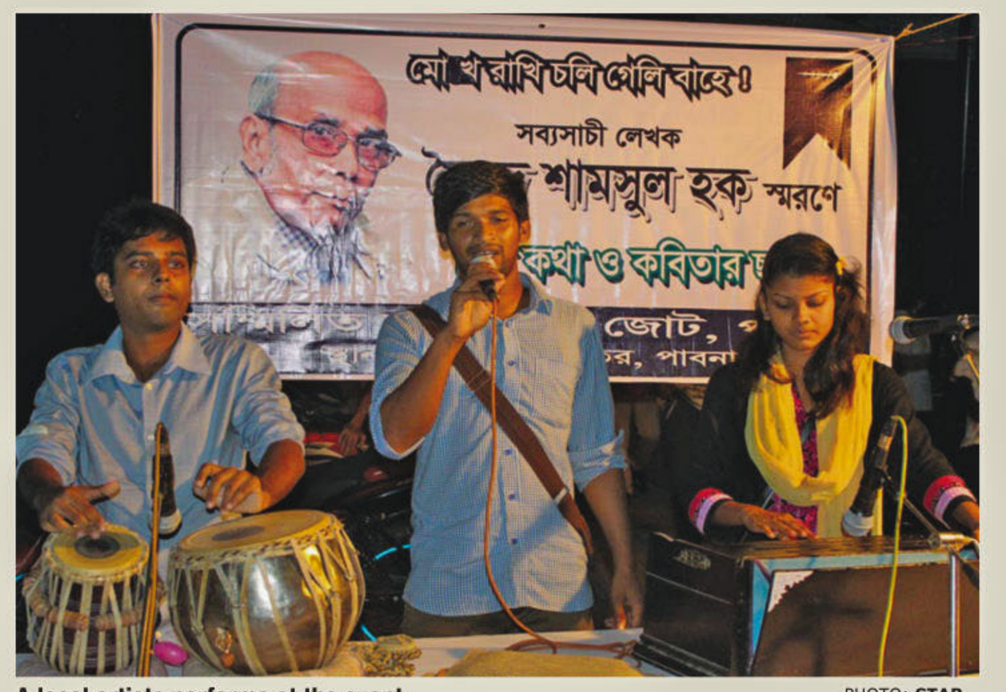
A local artiste performs at the event.

Artists performed songs written by Syed Samsul Haq on the occasion.