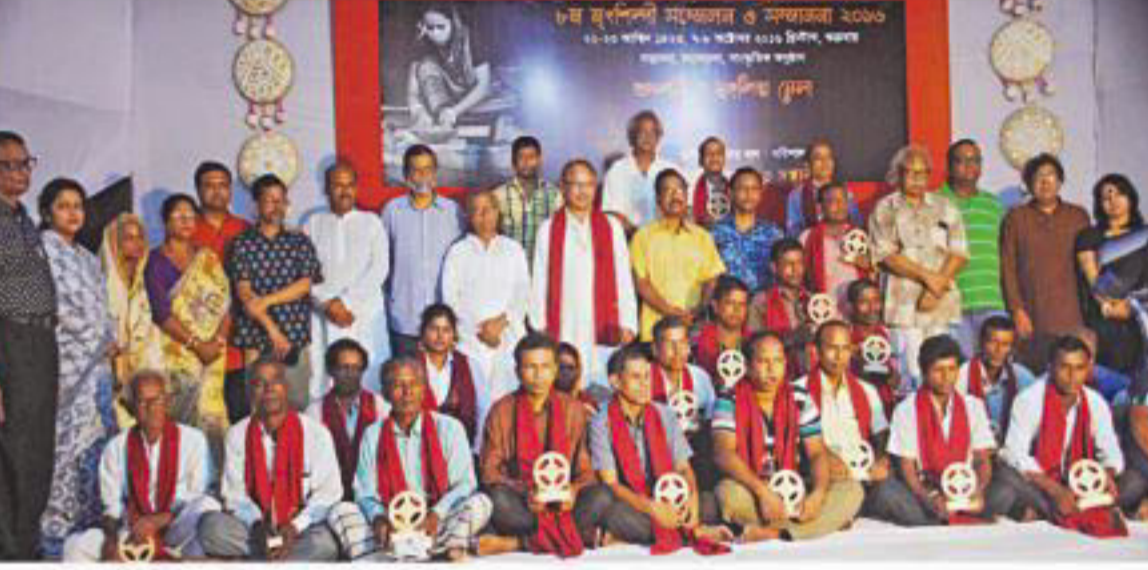
Guests along with artisans and potters at the closing ceremony of a two-day programme organised in Barisal city yesterday to honour the latter for their contributions in preserving the country's cultural heritage and traditional arts and crafts through the use of clay.

BSS, Ctg Air to air live firing exercise by fighter aircraft of Bangladesh Air Force (BAF) started at Kutubdia firing range in Chittagong yesterday. The exercise will continue till October 26, from 8:00am to 5:00pm. During this 19-day exercise, BAF fighter aircrafts -- F-7BG/FT-7BGI, F-7BG/FT-7BG, MiG-29B/UB, L-39ZA, K-8W, YAK-130 and F-7MB/FT-7B -- will practice different air combat maneuvers and tactics along with air to air live firing, an ISPR release said. The pilots of the mentioned aircrafts and other BAF personnel of different ranks are actively participating in the exercise.