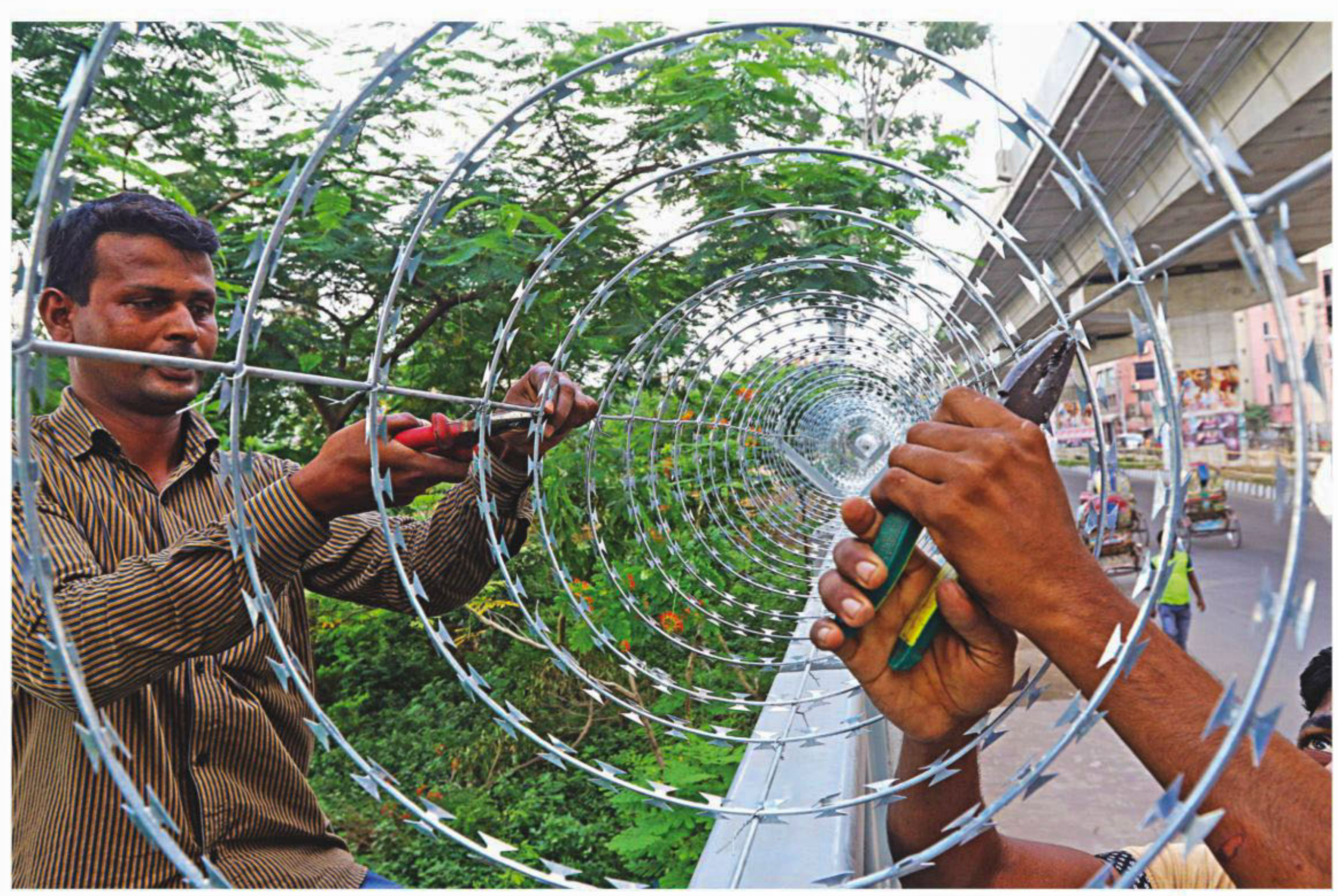
The Hatirjheel lake is being secured with razor wire on top of the iron fence near Moghbazar in the capital yesterday.

A CORRESPONDENT, Savar Armed muggers snatched around Tk 3 lakh from two men at Nicchintopur in Ashulia, on the outskirts of the capital, leaving them bullet-injured. Habibur Rahman, 20, is a sales representative of Garmeenphone, and Shohel Rana is a sales representative of Robi. Intercepting the two in Nicchintopur area around 2:30pm while they were going to the mobile operators' Narsinghopur local office, a group of four armed muggers riding in two motorcycles shot them and snatched their bags containing the money, police quoted locals as saying. Critically injured, they were first taken to Nari O Shishu Hospital in Ashulia and then to Dhaka Medical College Hospital, said Mohoshinul Kadir, officer-in-charge of Ashulia Police Station.