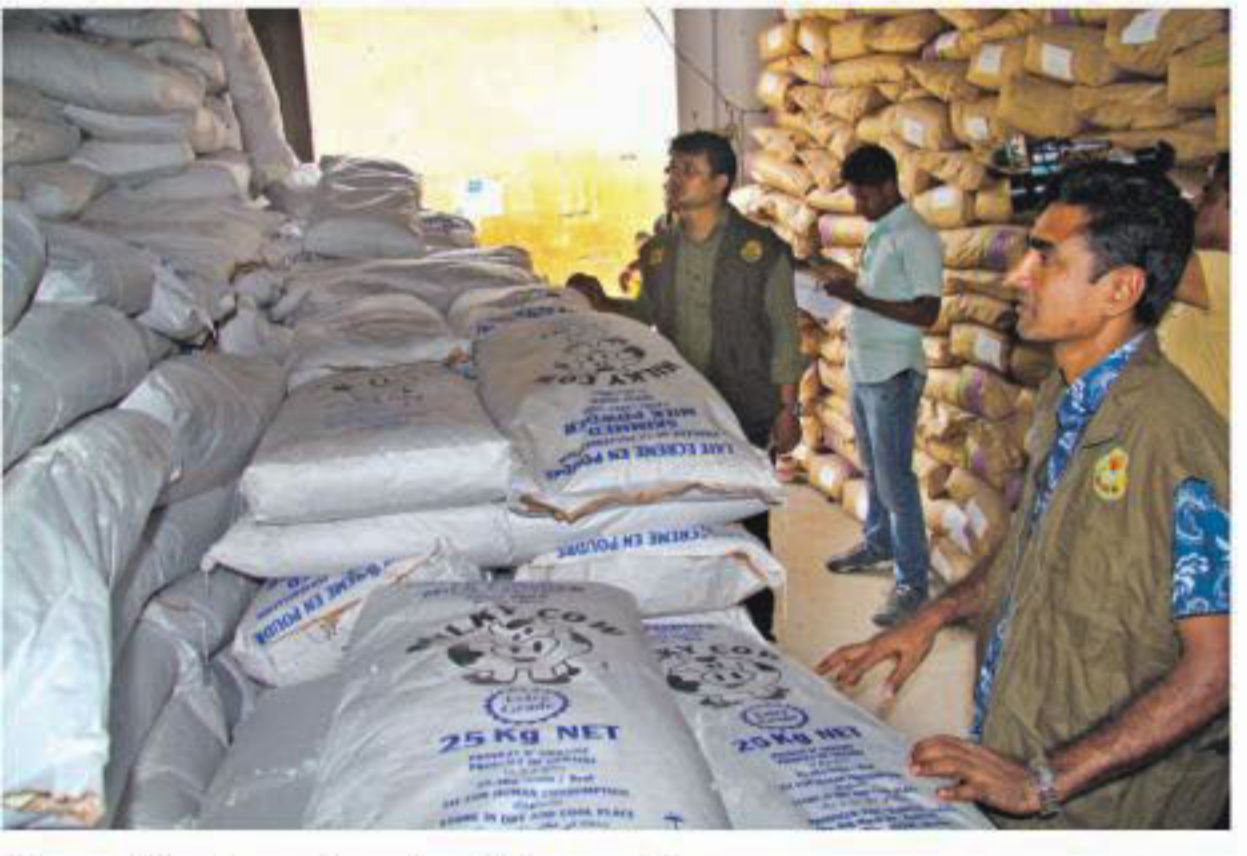
The seized sacks of milk powder.