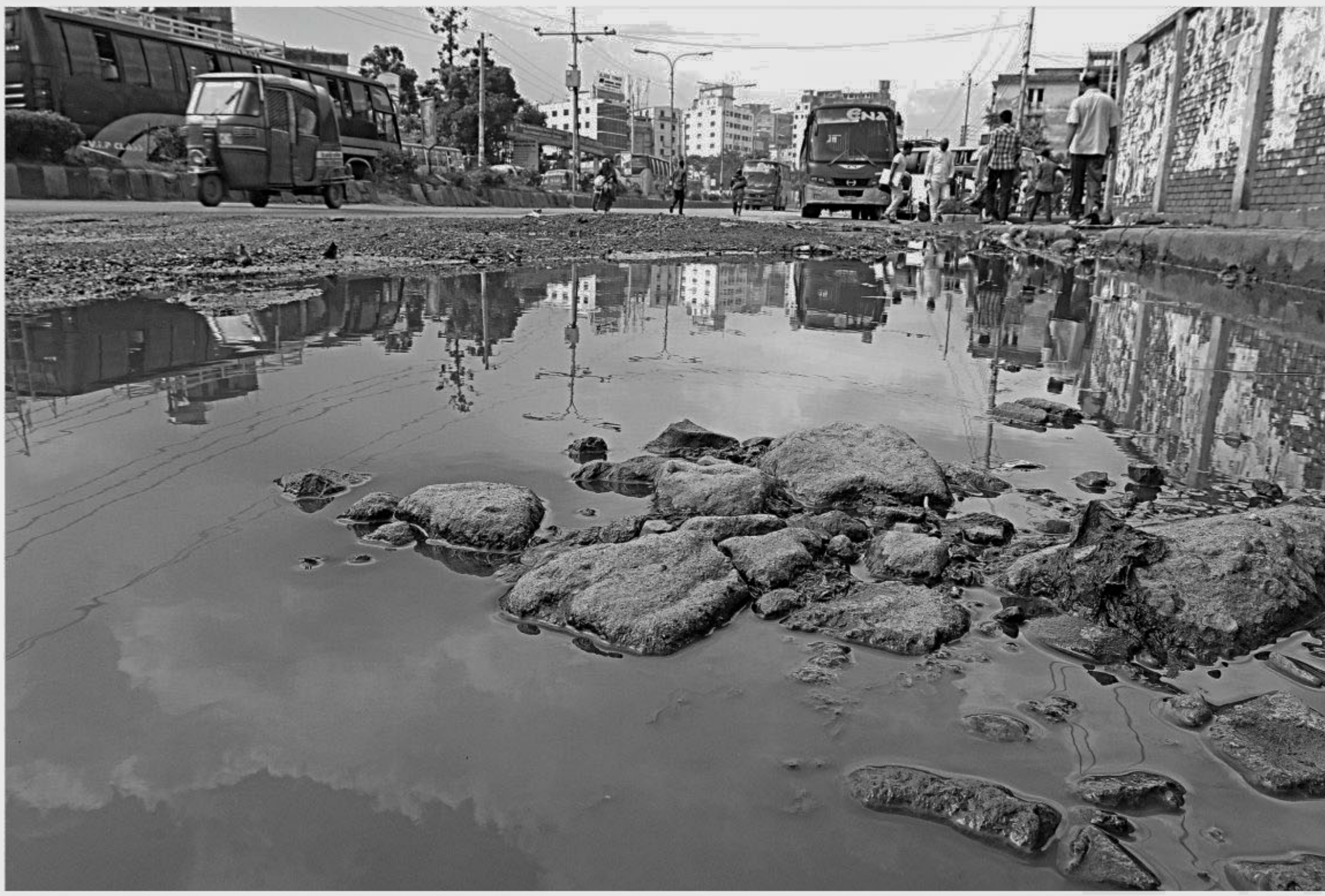
This dilapidated road lies right in front of the Mohakhali bus terminal, one of the busiest in the capital. The photo was taken yesterday.

A memorial discussion will be held tomorrow at 5:00pm at Mukti Bhaban near Comrade Moni Singh Road in the capital.