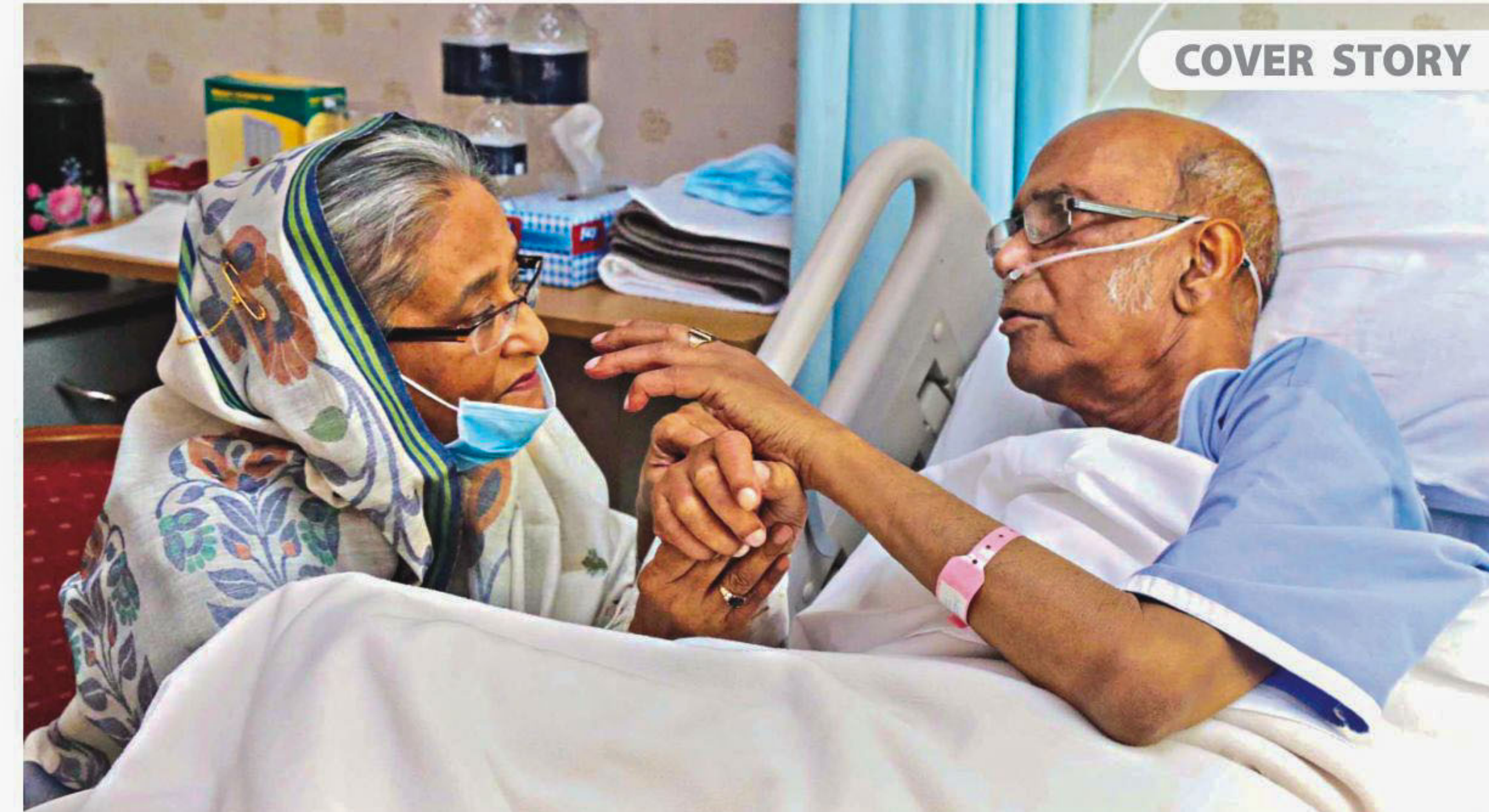
Honorable Prime Minister Sheikh Hasina's visit at the hospital

Our readers are well aware about the Daily Star's initiative titled Celebrating Life, which focuses on film, photography and lyrics. Under the banner of film, is the film-making workshop, through which, we once decided to make documentaries on seven celebrated personalities of Bangladesh, one of which was Syed Shamsul Haq. The list had names like Mustafa Monwar, Serajul Islam Choudhury, Manzur Elahi and the likes. With my protracted involvement in showbiz, I have had the opportunity to meet with him often, but to me, he always appeared to be an esteemed luminary. He was a fashionista whose elegant attire always echoed of his presence. The manner, in which he would present the TV programmes with distinctiveness, truly made him a class apart. Unfortunately, by the time we approached him regarding the documentary, his health condition had deteriorated; yet, he was rather enthusiastic about the overall idea, and suggested that he would like to be a part of it once he returned after his treatment. I still remember the remark he had made about me, mentioning that I looked like a modern day Rabindranath Tagore, due to my poet-like appearance with the long hair and a beard. He also stated that looking at me, he could envision a character for one of his literary pieces, to which he would like to give life to and therefore sought to meet with me soon. To me, it was a matter of pride that my appearance had inspired him to pen down a fiction.