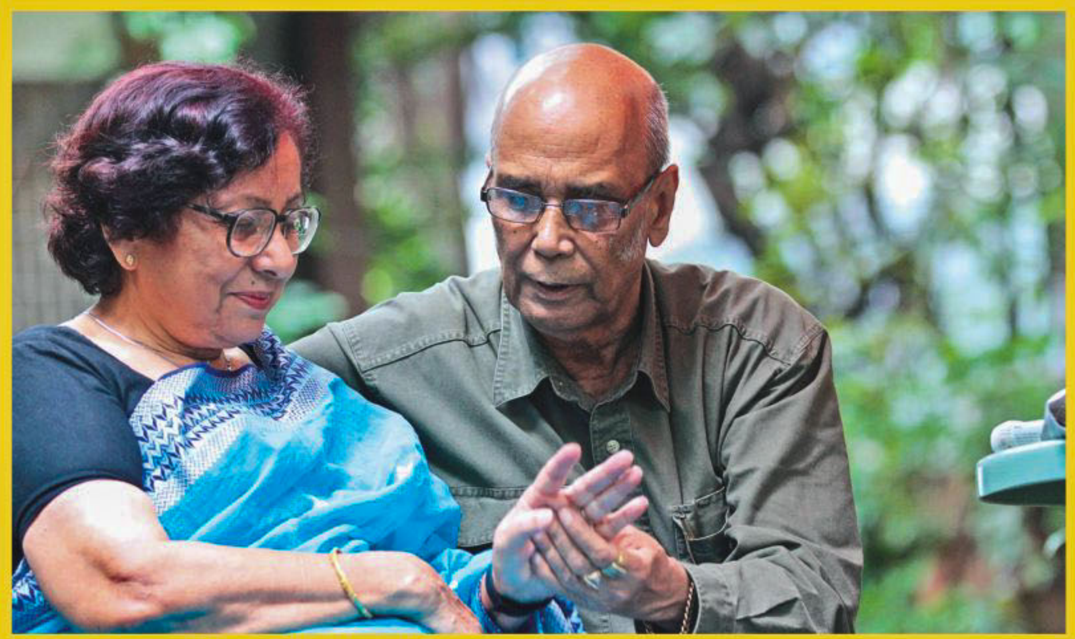
Syed Shamsul Haq with his wife