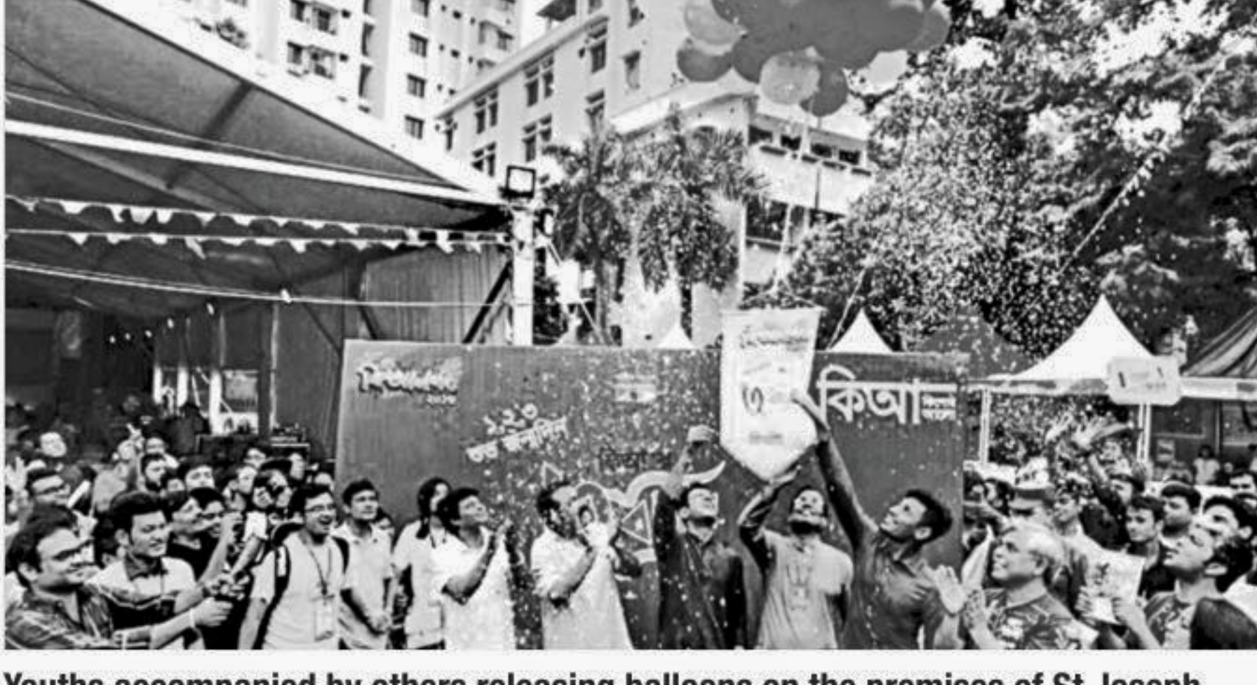
Youths accompanied by others releasing balloons on the premises of St Joseph Higher Secondary School in the capital's Mohammadpur yesterday, marking the third anniversary of launching of Kishore Alo, a monthly Bangla magazine of Prothom Alo for youngsters.