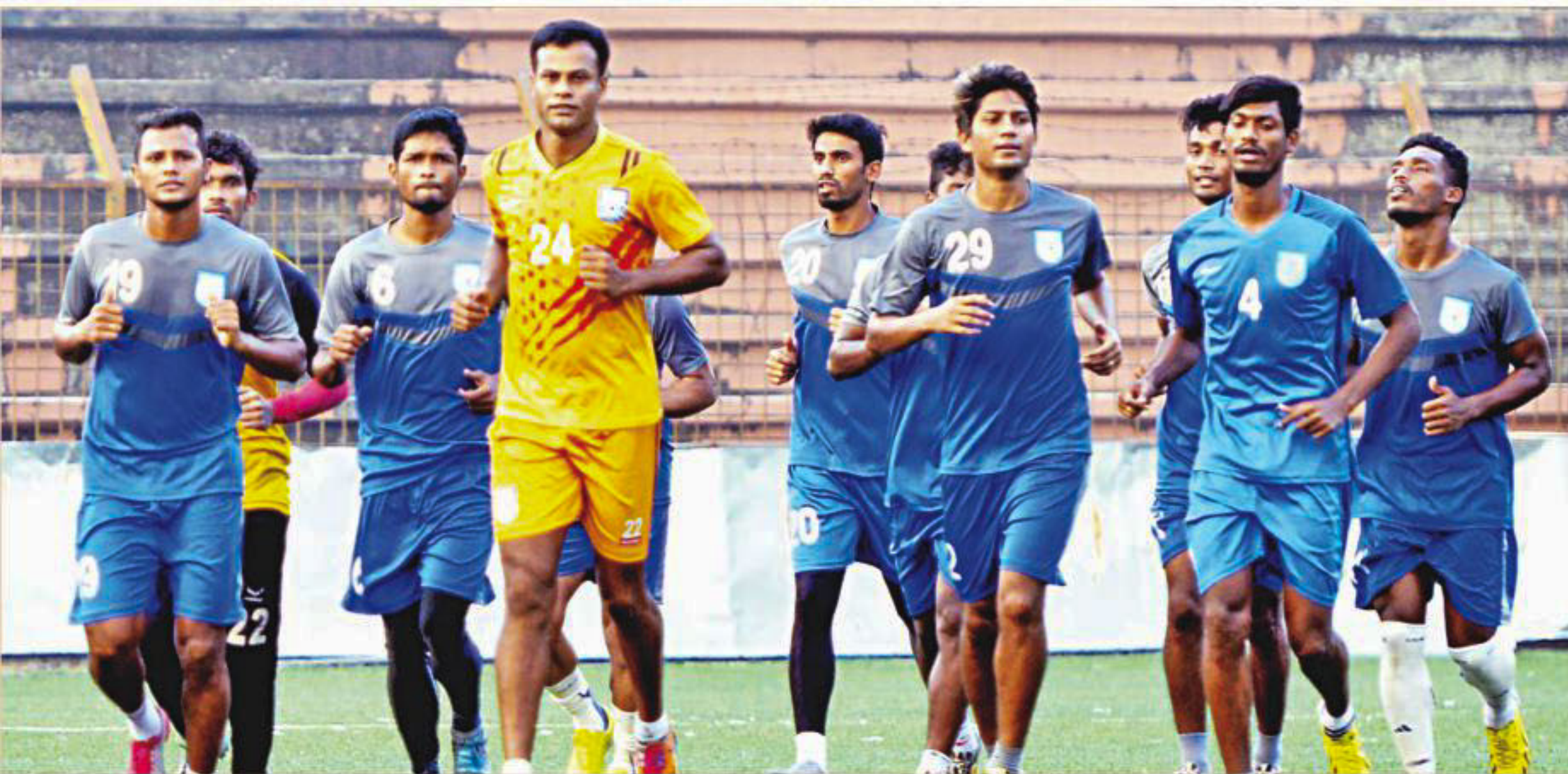
Bangladesh players jog during their last training session before leaving for Bhutan at the Bishreshtha Shaheed Mostafa Kamal Stadium in Kamalapur yesterday.

FIFA announced on Tuesday a set of sanctions against several federations, with Mexico ordered to pay around $31,000 over the use of the slur at the 2018 World Cup qualifying game against Honduras in September.