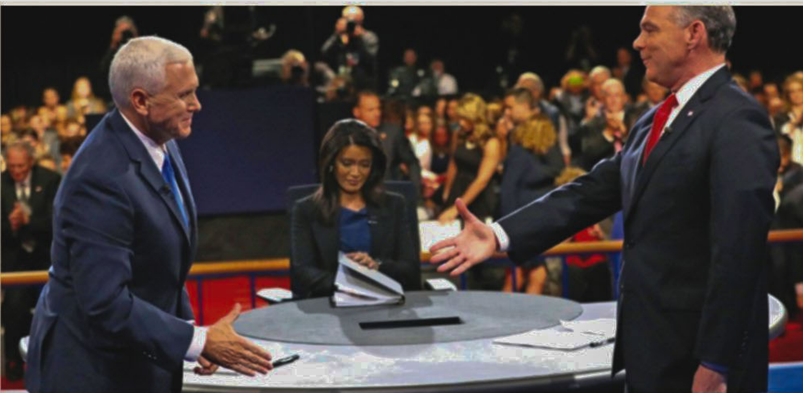
Democrat Tim Kaine and Republican Mike Pence: Men who could be a heartbeat away from the presidency.

In other categories fall bans, walls; xenophobic antagonisms to ensure that America is for the Americans. The trade pacts with important nations or groups of countries would have to be rewritten for American companies to stay home