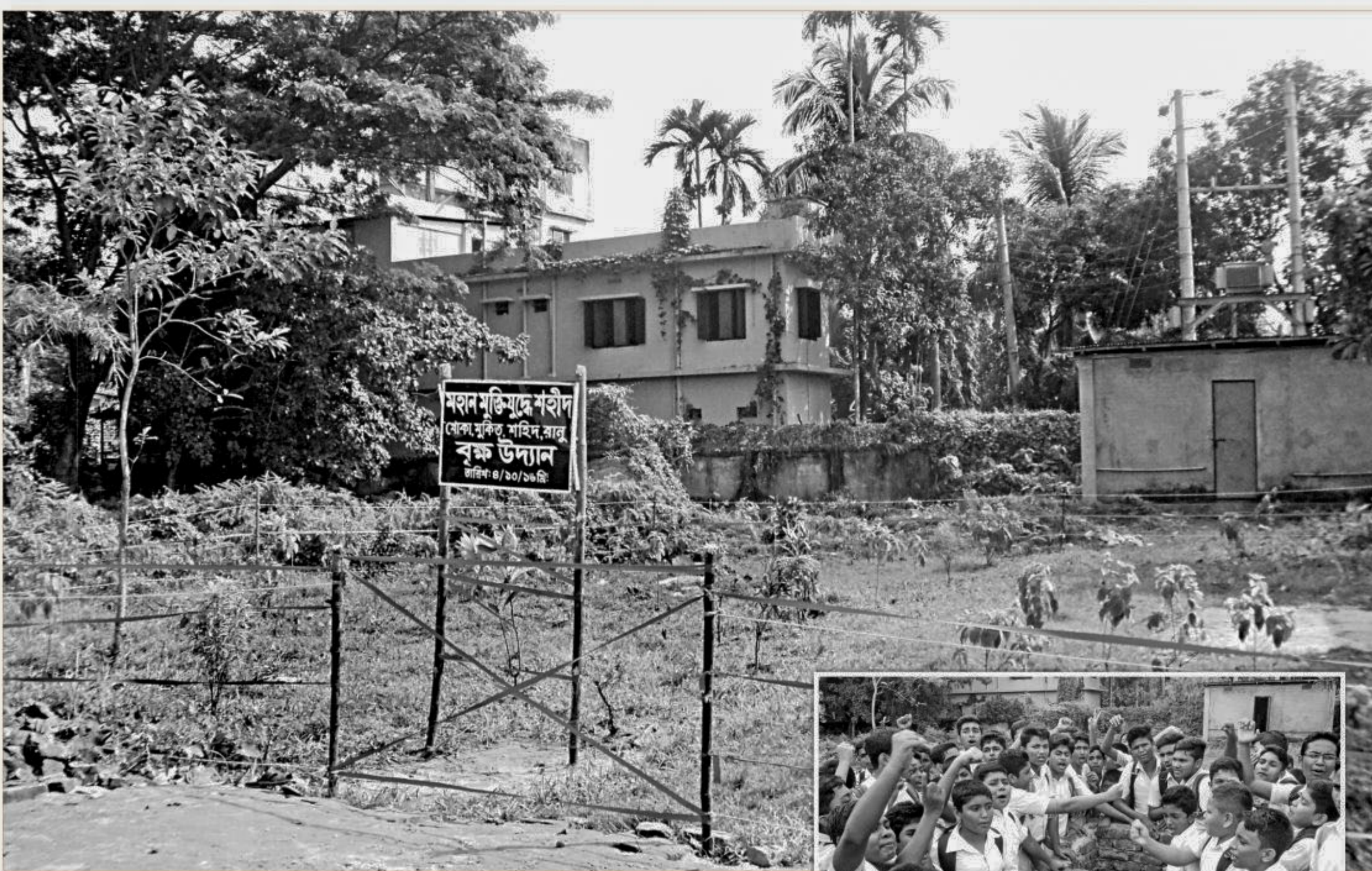
Students of Moulvibazar Government High School in Sadar upazila put up a sign-board after making a garden in the school ground where the education engineering department laid a foundation stone, inset, to construct its office building.