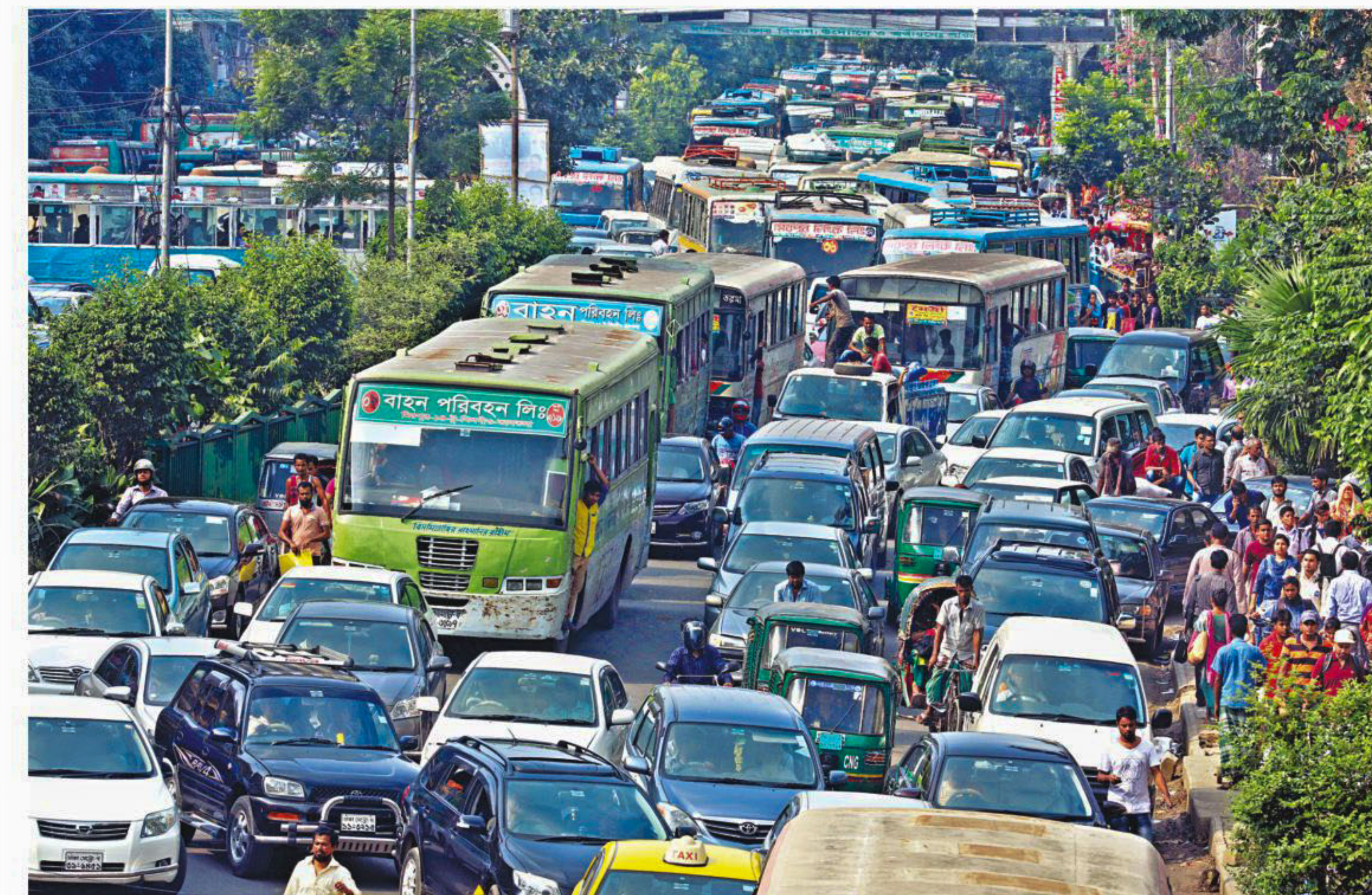
Not going anywhere under the mid-day sun, commuters and vehicles bake in a huge traffic snarl-up at the city's Science Laboratory intersection yesterday. Students of the College of Home Economics occupied the nearby Nilkhet roundabout for hours. They demand turning their college into an institute of Dhaka University.