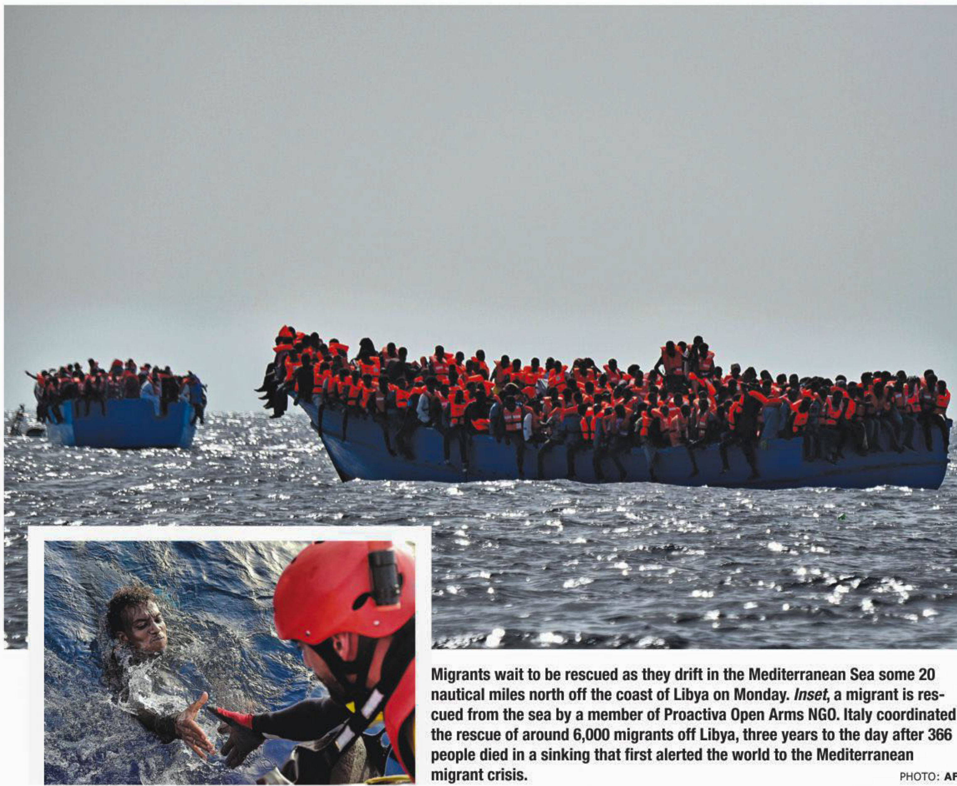
Migrants wait to be rescued as they drift in the Mediterranean Sea some 20 nautical miles north off the coast of Libya on Monday. Inset, a migrant is rescued from the sea by a member of Proactiva Open Arms NGO. Italy coordinated the rescue of around 6,000 migrants off Libya, three years to the day after 366 people died in a sinking that first alerted the world to the Mediterranean migrant crisis.