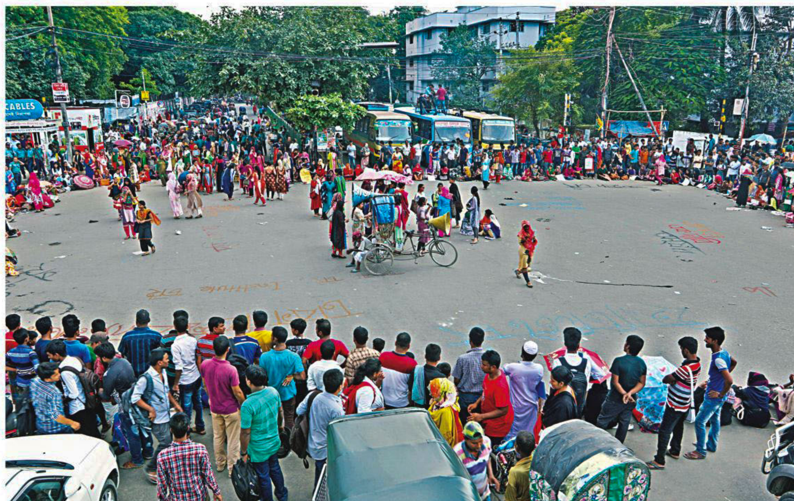
Blocking the busy Mirpur road, students of the College of Home Economics demonstrating at the capital's Nilkhet intersection yesterday, forcing vehicles to come to a grinding halt and causing tremendous sufferings to commuters.