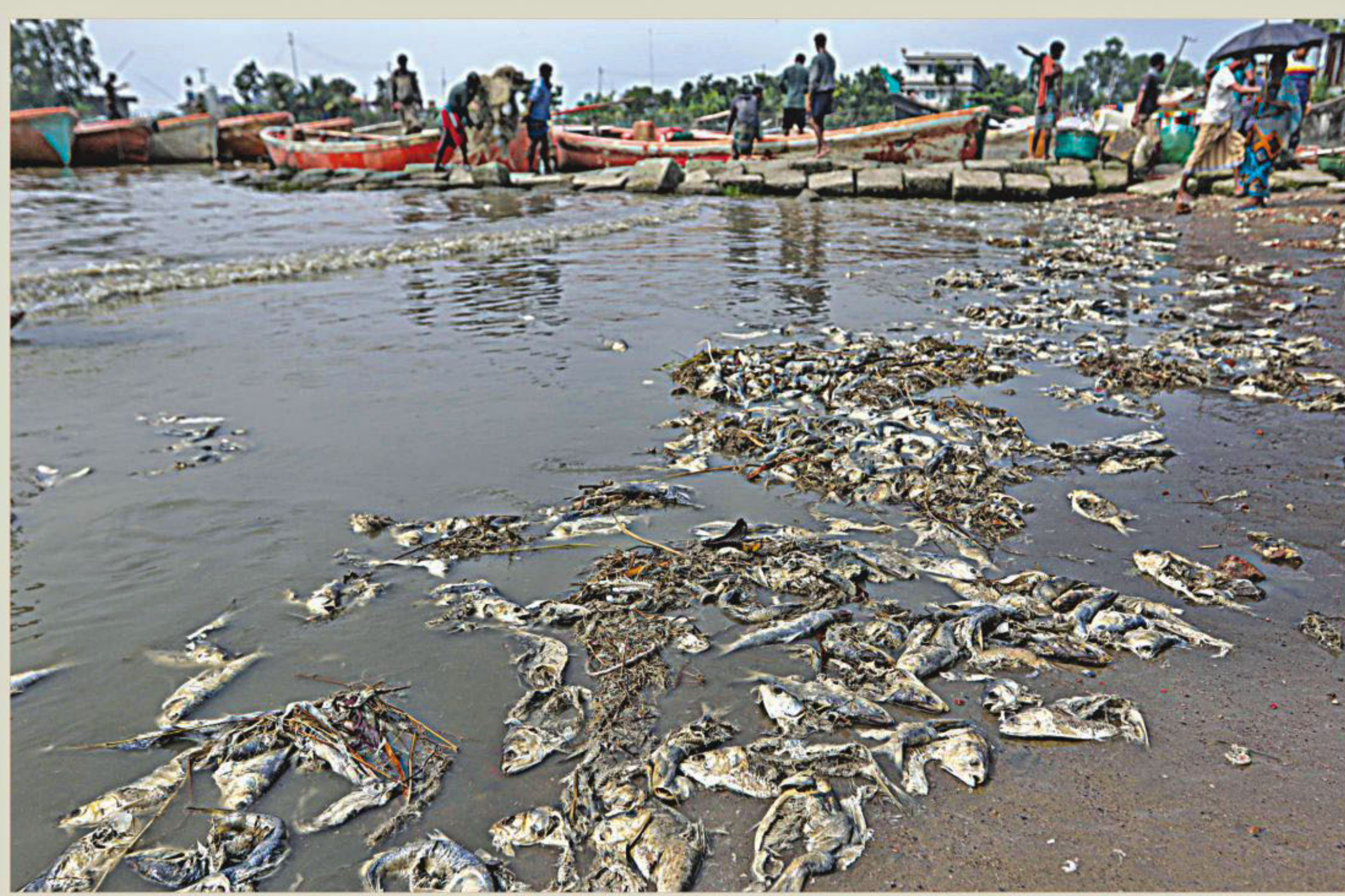
Hilsas, the prized bounty of the sea, dumped to rot at Kumira Ghat of Sitakunda upazila in Chittagong yesterday. After having plentiful catch in the past two days, fishermen got rid of the fish because buyers were few and high prices of salt and ice needed to preserve the fish made it unprofitable for them.