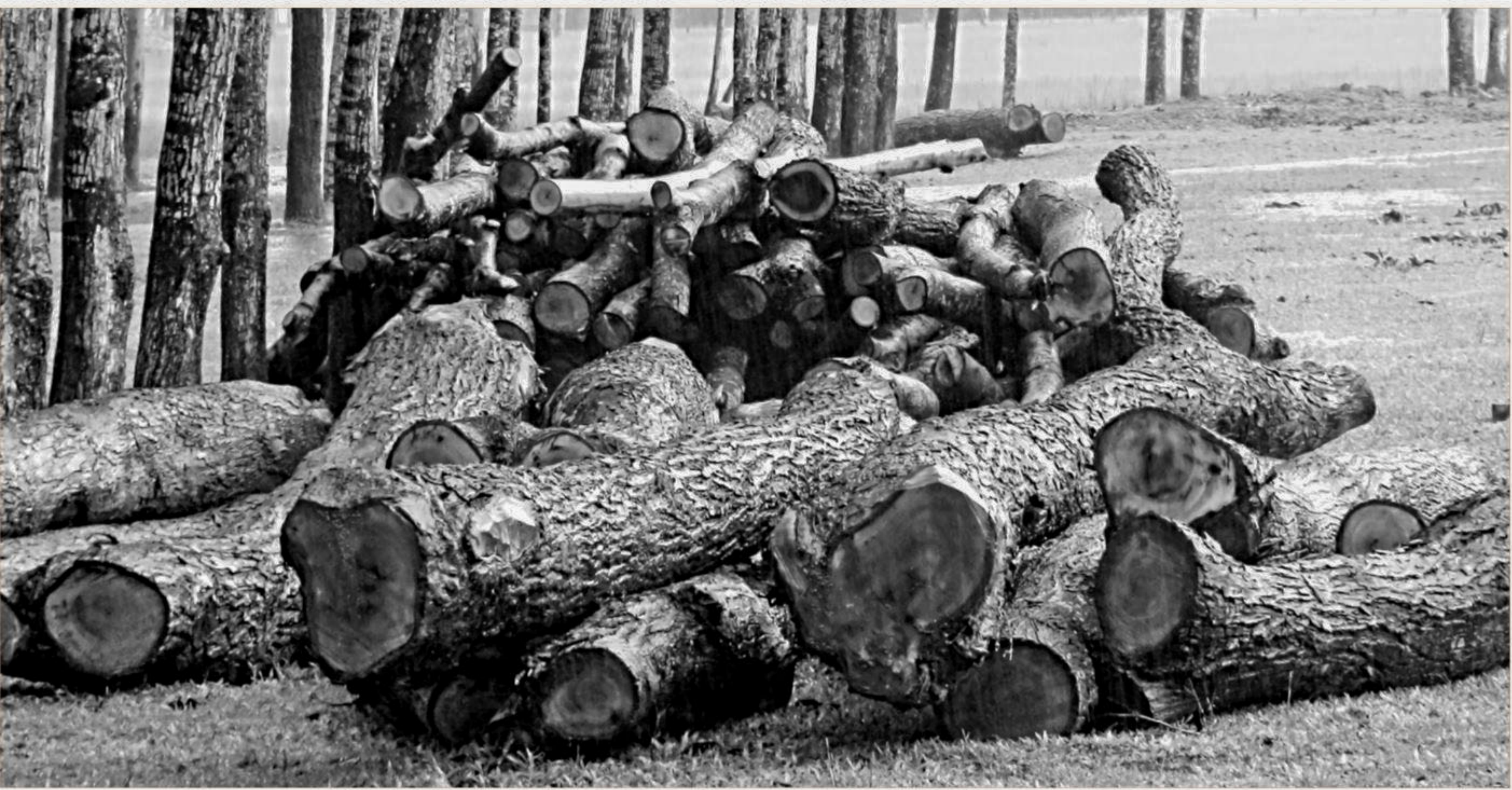
Logs from felled mahogany trees on Amlahar Degree College ground in Sadar upazila of Panchagarh. The photo was taken a few days ago.