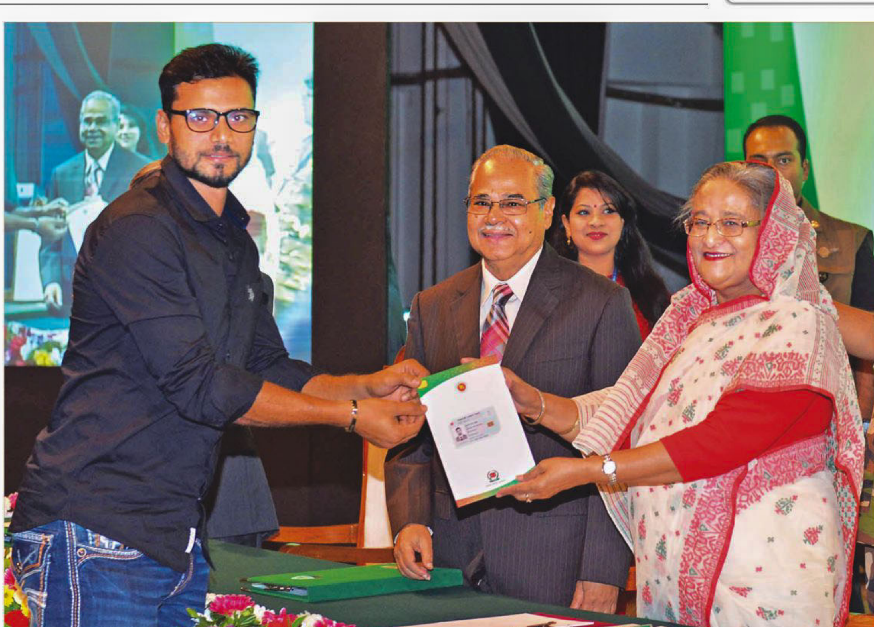
Prime Minister Sheikh Hasina hands Bangladesh cricket team captain Mashrafe Bin Mortaza his smart national ID card at a function in the capital's Osmani Memorial Auditorium yesterday. The distribution of the more secure cards kicked off at the event.

PM tells EC at launch of smart NID cards BSS, Dhaka Prime Minister Sheikh Hasina yesterday asked the Election Commission to ensure the security of the data being used for preparing smart national identity (NID) cards, saying there should be a firewall in such a digital project to check forgery. She was inaugurating the distribution of smart NID cards at a function in the capital's Osmani Memorial Hall. Hasina said: "There are adequate technologies in the country and it's very much necessary to utilise them to check forgery in using the smart NID cards." The EC launched distribution of the much-awaited machine-readable smart NID cards among 10 crore citizens, replacing the existing paper-laminated cards. SEE PAGE 10 COL 1