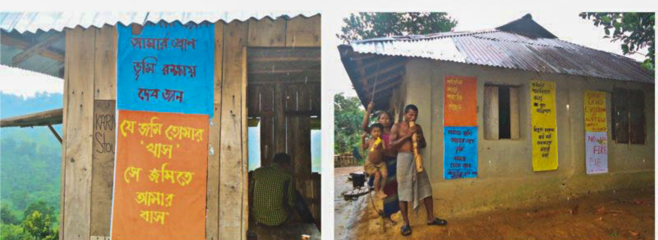
A Jhum land at Alutila in Khagrachhari where a special tourism zone is going to be established following the acquisition of around 700 acres of Jhum land. About 300 indigenous families would lose their Jhum land if the zone is set up there. Below, one of the families stands near their house which has posters on it against the move.