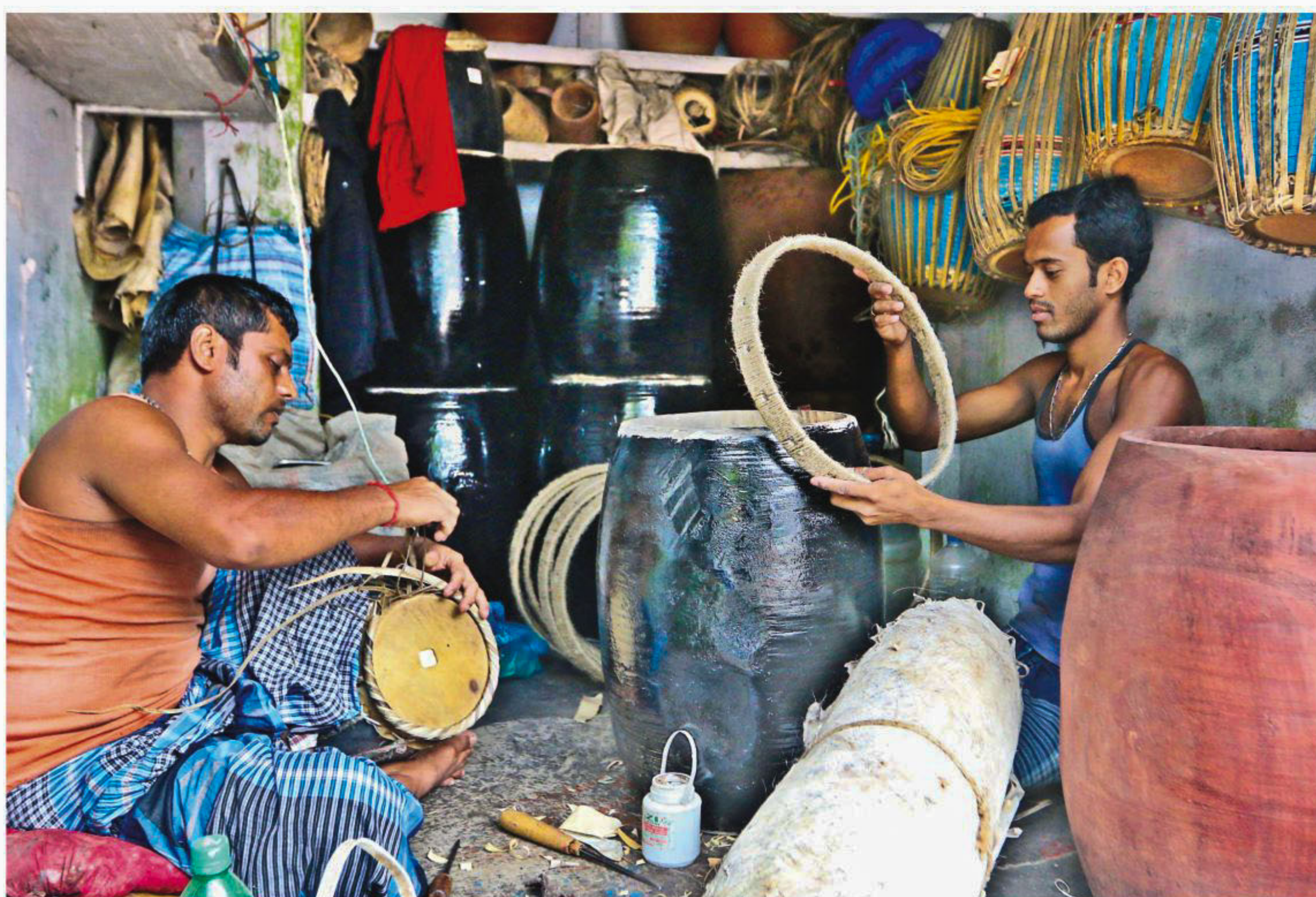
Two men busy making dhak (big drums) and dhol (drums) inside a shop in Chittagong city's Pathorghata area as Durga Puja, the largest religious festival of the Hindus, is just a few days away. The demand for such instruments, an integral part of the festival, picks up ahead of the puja every year. The photo was taken on Wednesday.