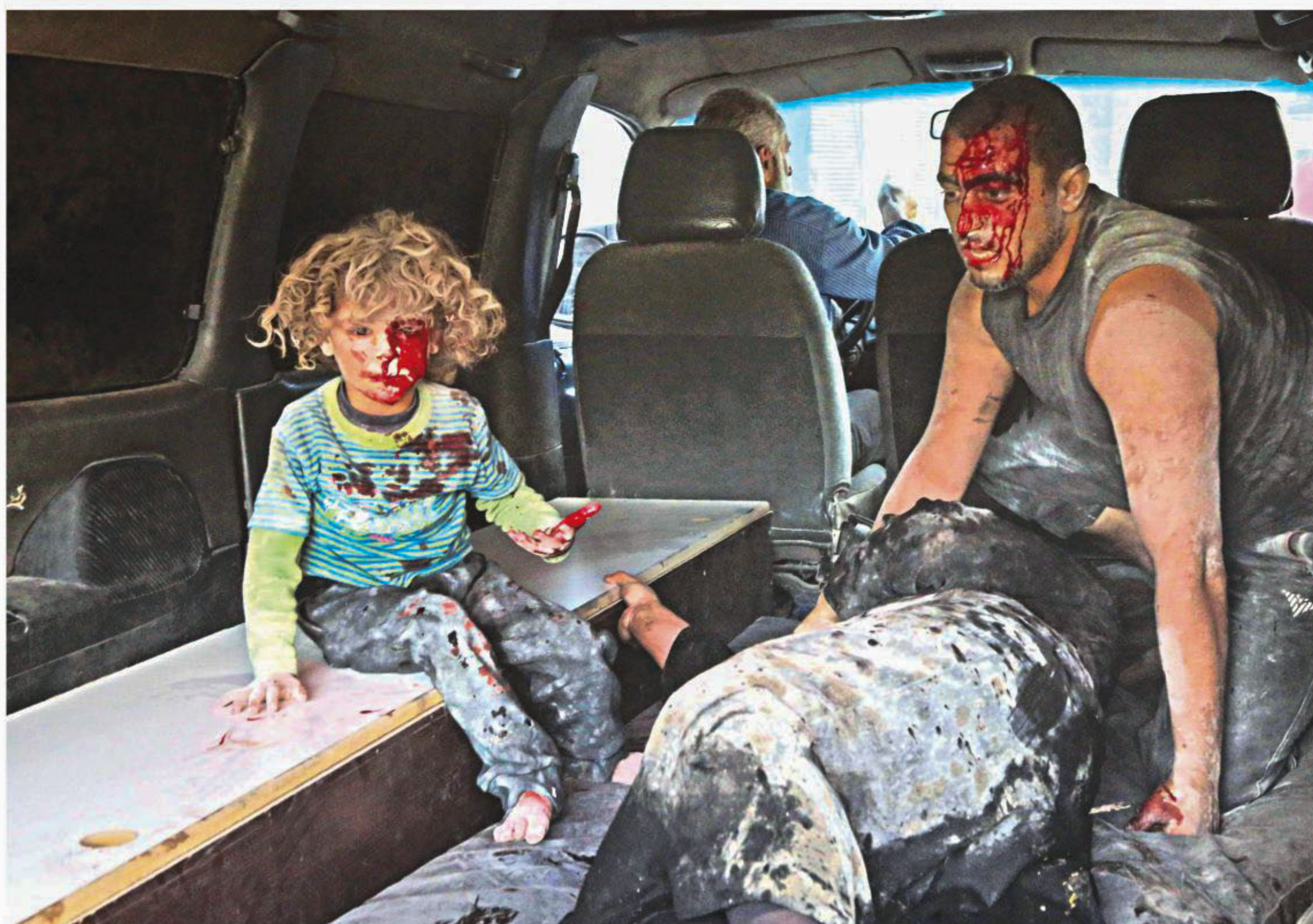
A wounded Syrian child looks on from inside a vehicle following a reported airstrike on Kafr Batna in the rebel-held Eastern Ghouta area on the outskirts of the Syrian capital Damascus. The photo was taken on Friday. Story on page 8.