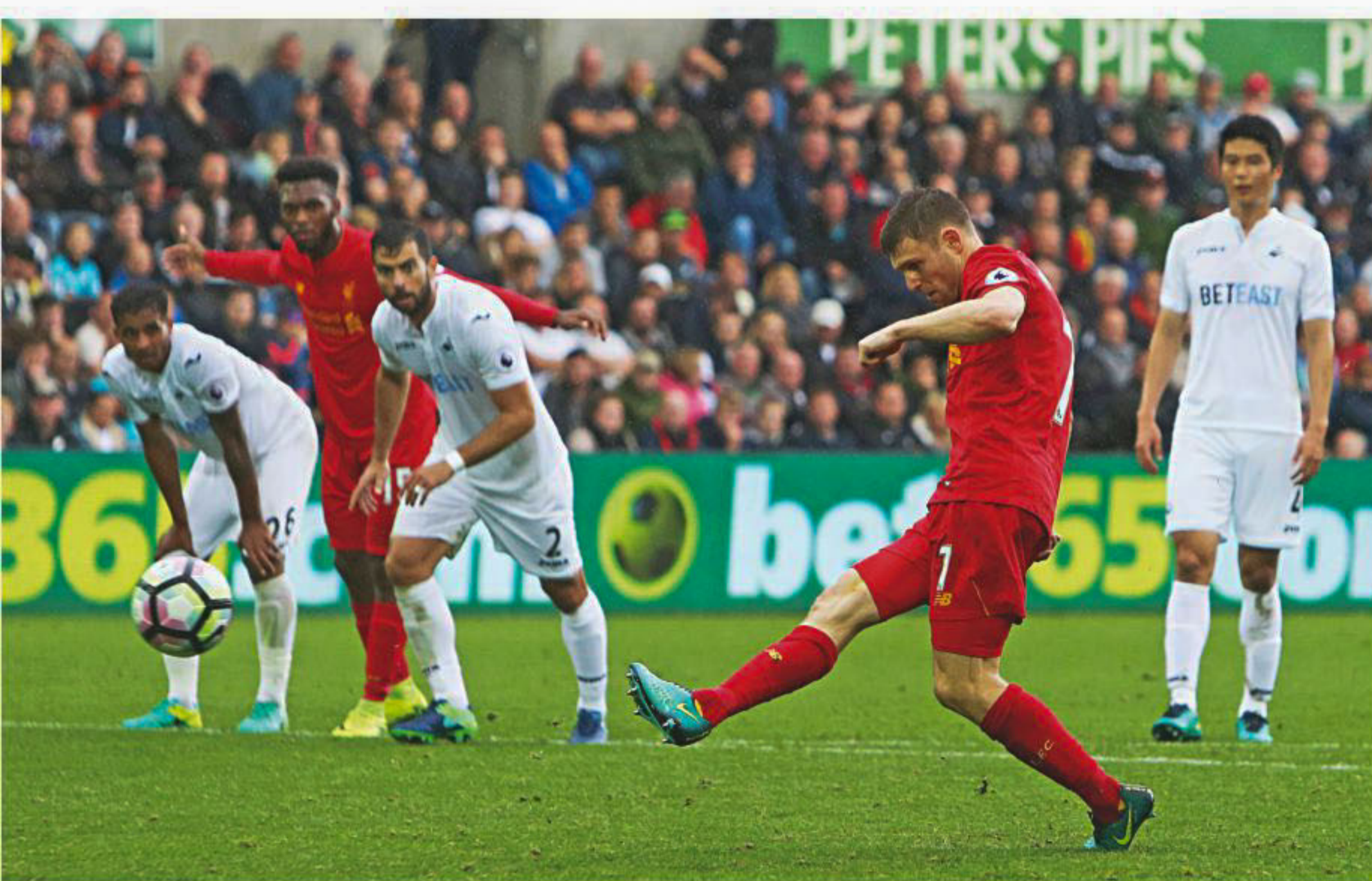
Liverpool fullback James Milner scores the second goal from a penalty during their Premier League match against Swansea City at the Liberty Stadium yesterday.

WIN #88 V ENGLAND, MAR 9, 2015: The most recent and perhaps the most defining win was Bangladesh's win over England in the 2015 World Cup. Showing off the brand of cricket for which they have now become famous, Mashrafe's men, powered by Mahmudullah Riyad's ton