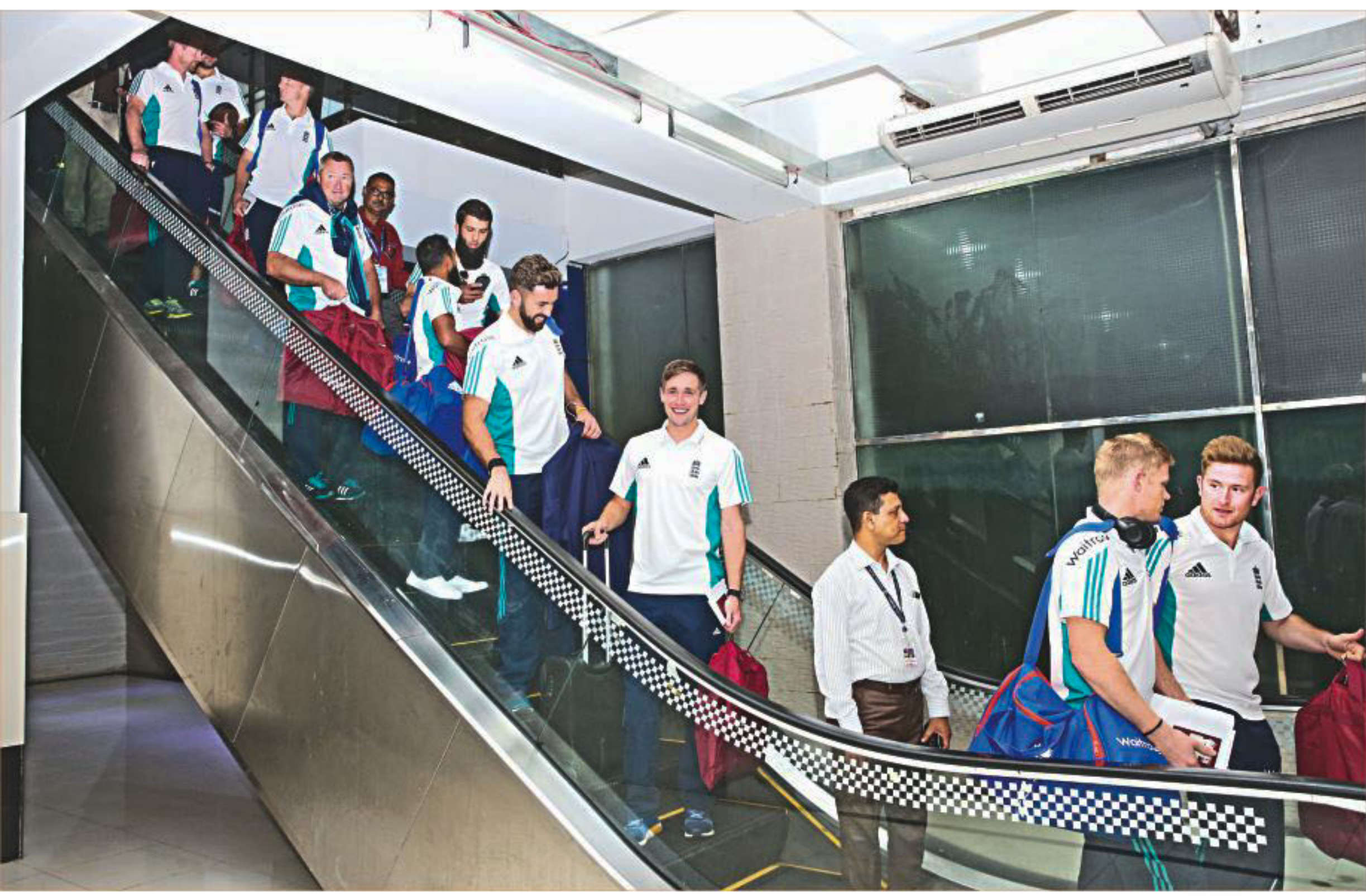
The England ODI squad are all smiles after landing at the Hazrat Shahjalal International Airport in Dhaka yesterday. England are here for a three-ODI and two-Test series starting with the first ODI in Dhaka in Mirpur on October 7.