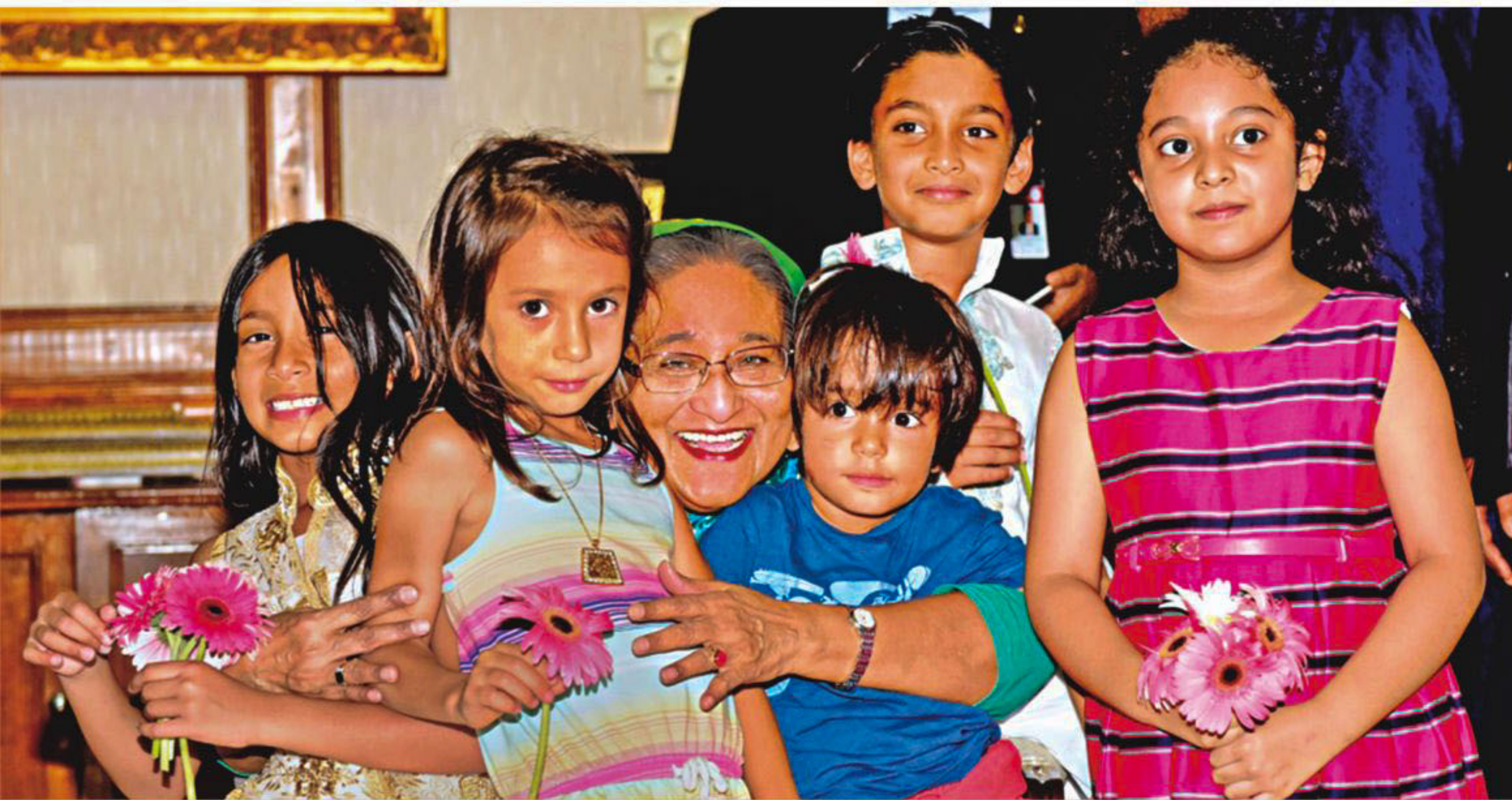
WELCOME HOME ... A cheerful Sheikh Hasina with her grandchildren and other family members at the Gono Bhaban yesterday. The prime minister returned yesterday after her trips to Canada and the US.