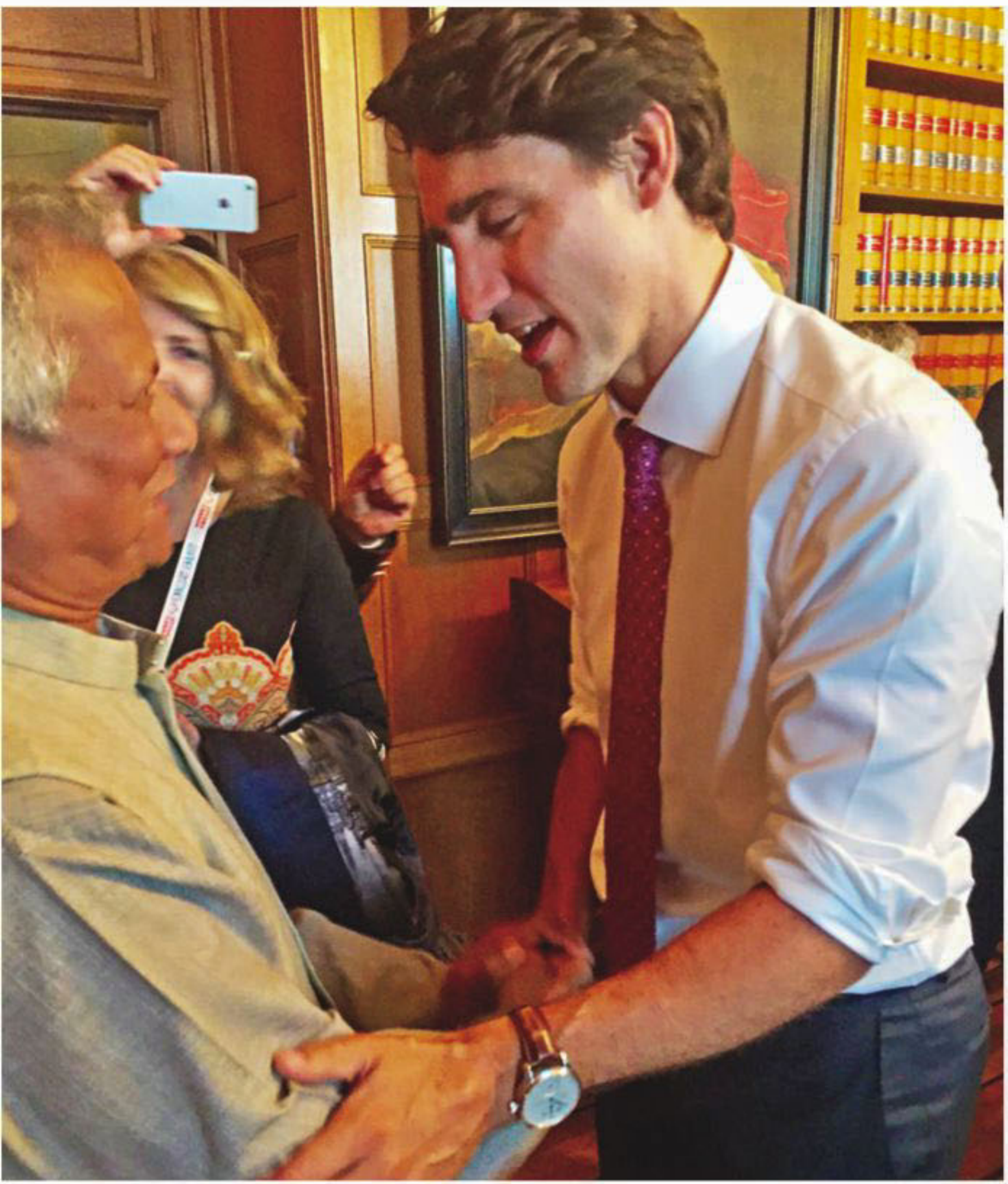
Canadian Prime Minister Justin Trudeau discusses youth issues with Nobel Laureate Prof Muhammad Yunus before the opening of the One Young World Summit at Parliament Hill in Ottawa on Wednesday.