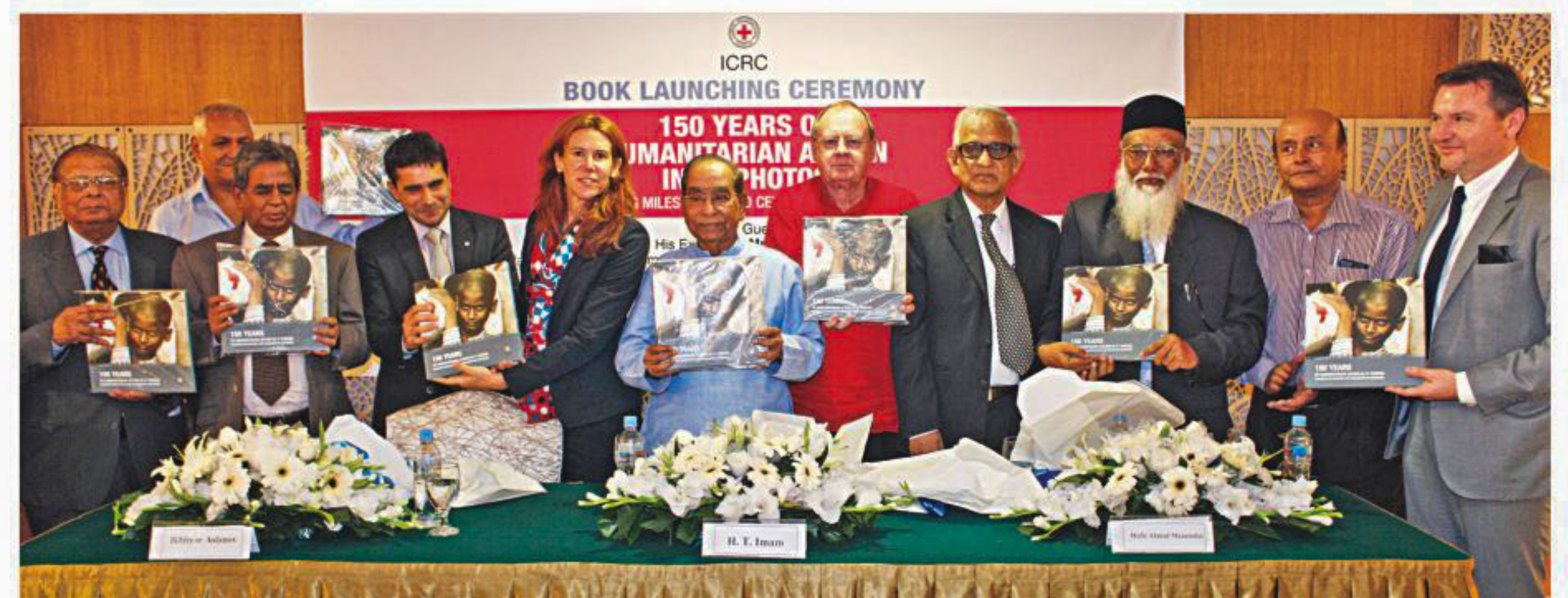
Guests hold the copies of "150 Years of Humanitarian Action in 71 Photos" of the International Committee of the Red Cross (ICRC) in a hotel in Dhaka yesterday. Prime Minister's Political Affairs Adviser HT Imam was, among others, present at the publication ceremony. The books are based on 71 photos of two exhibitions ICRC held in Dhaka and Chittagong in 2014, highlighting its humanitarian operations in 1971 conflict, post-conflict contexts and current challenges.