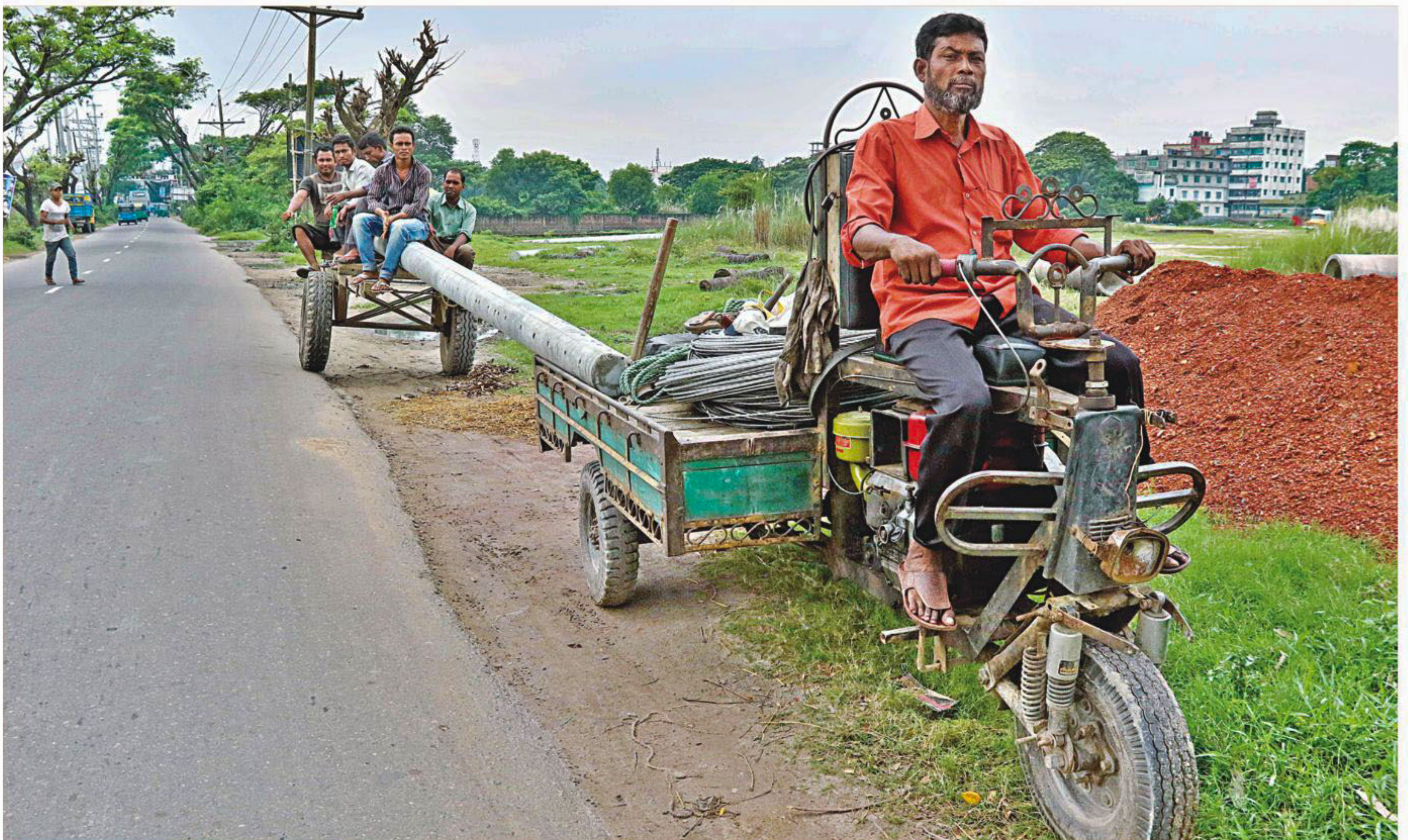
Ignoring risks of accidents, a contractor transports an around 50-foot concrete electricity pole, precariously placed between a Nosimon, an improvised three-wheeler, and a pushcart on the Keraniganj-Dohar road. The contractor resorted to the hazardous process because Bangladesh Rural Electrification Board, which hired him, did not have a vehicle suited for the job. The photo was taken at Godarbagh Konakhola, Keraniganj on Tuesday around noon.